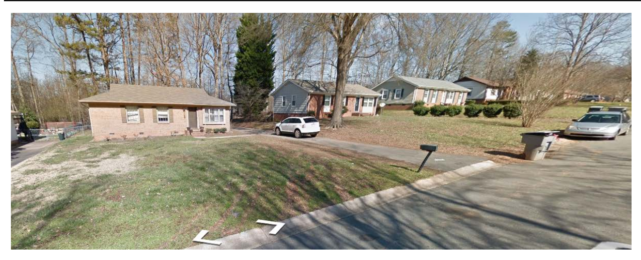
To the east of the site is a single family subdivision.