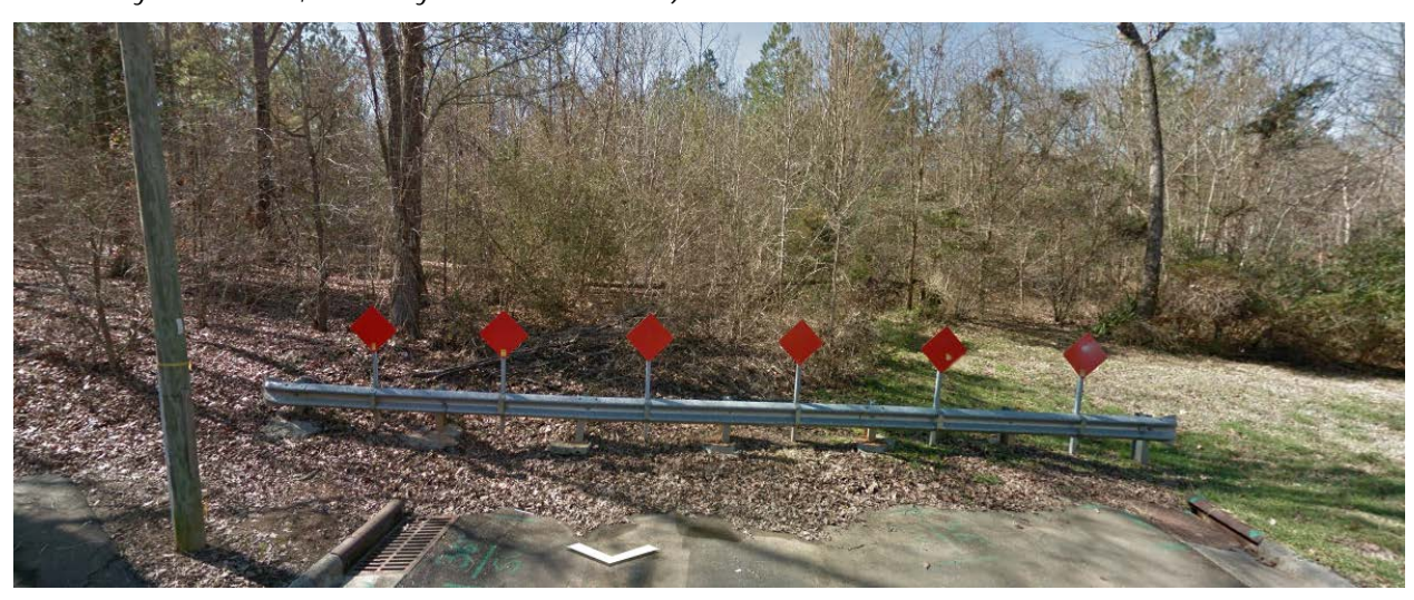
The property is currently undeveloped/vacant.