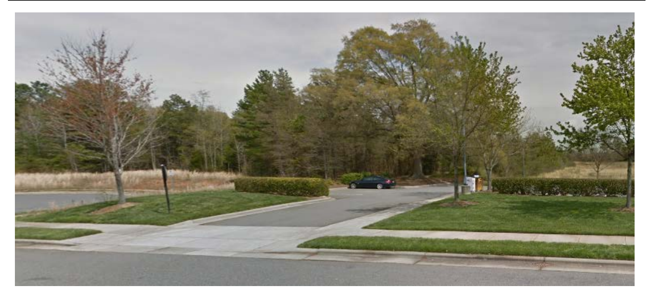
The current site is vacant with the exception of a small parking lot.