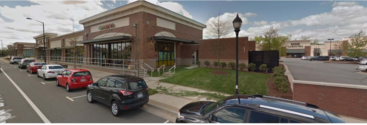
Across Ikea Boulevard from the property is a shopping center.