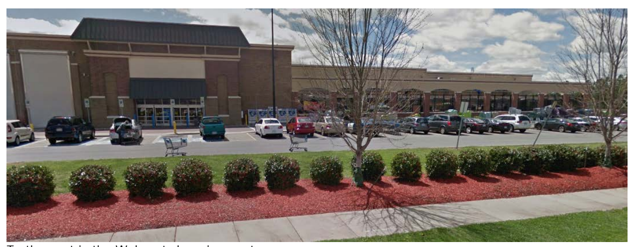
To the east is the Walmart shopping center.