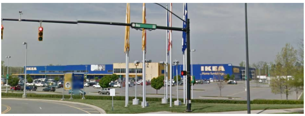
To the south is the Ikea retailer.