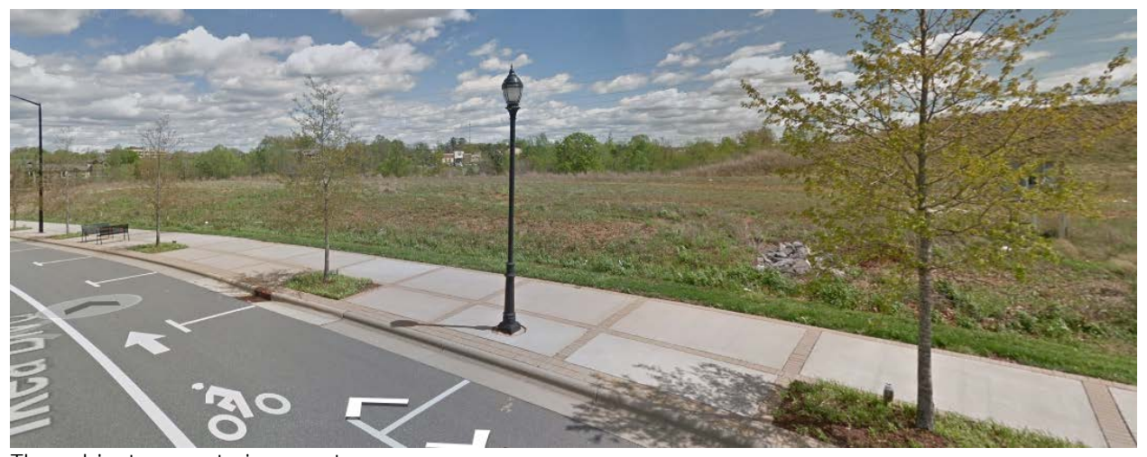
The subject property is vacant.