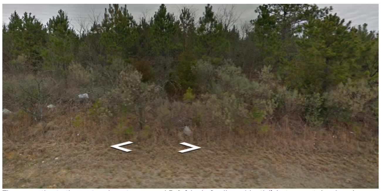
The properties to the east and west are zoned R-3 (single family residential) but are not developed.