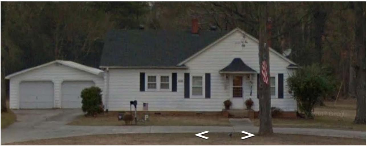
The subject property is zoned R-3 (single family residential) and developed with one single family structure.