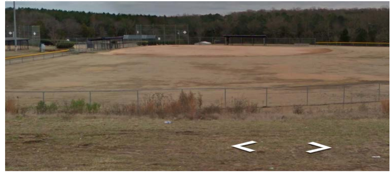
The property to the south is zoned INST (institutional) and developed with recreational fields for a religious institution.