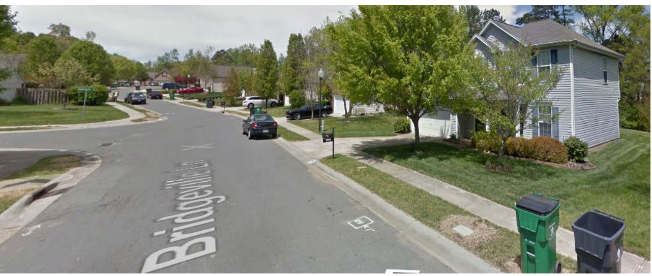
The property to the north is zoned MX-2 (mixed use) and developed with single family houses.