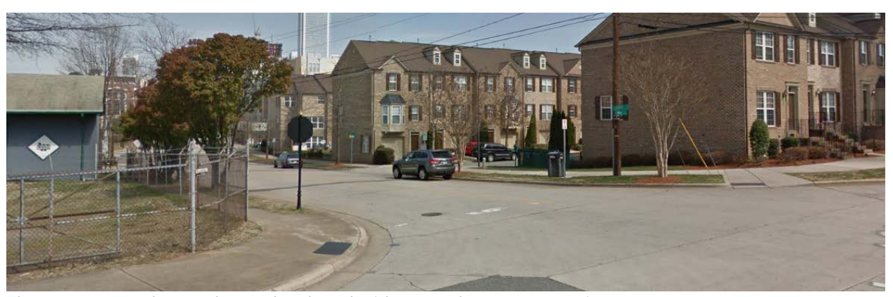
The property to the southeast developed with a townhome community.