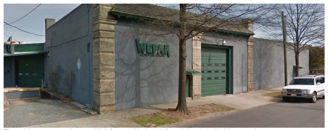
The subject property is zoned I-2 (general industrial) and developed with a warehouse use.

Properties surrounding the subject site are zoned a mix of industrial, MUDD (mixed use development) and various transit oriented districts.