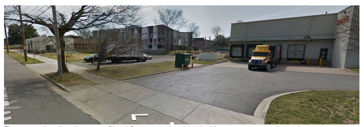
The properties directly across Bland Street are developed with a restaurant and warehouse use.