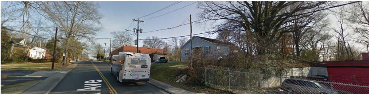
Properties to the north of the subject property include one single family home, a church, and a convenience store.