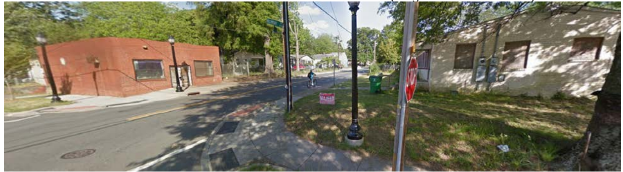
Properties to the south of the subject property include a commercial building and single family residential.