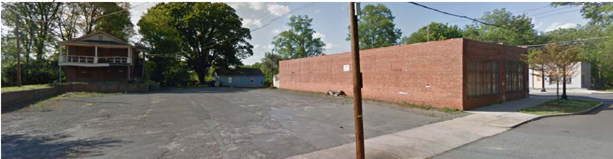
1035 Harrill Street – A commercial structure is located in B-1 (neighborhood business)