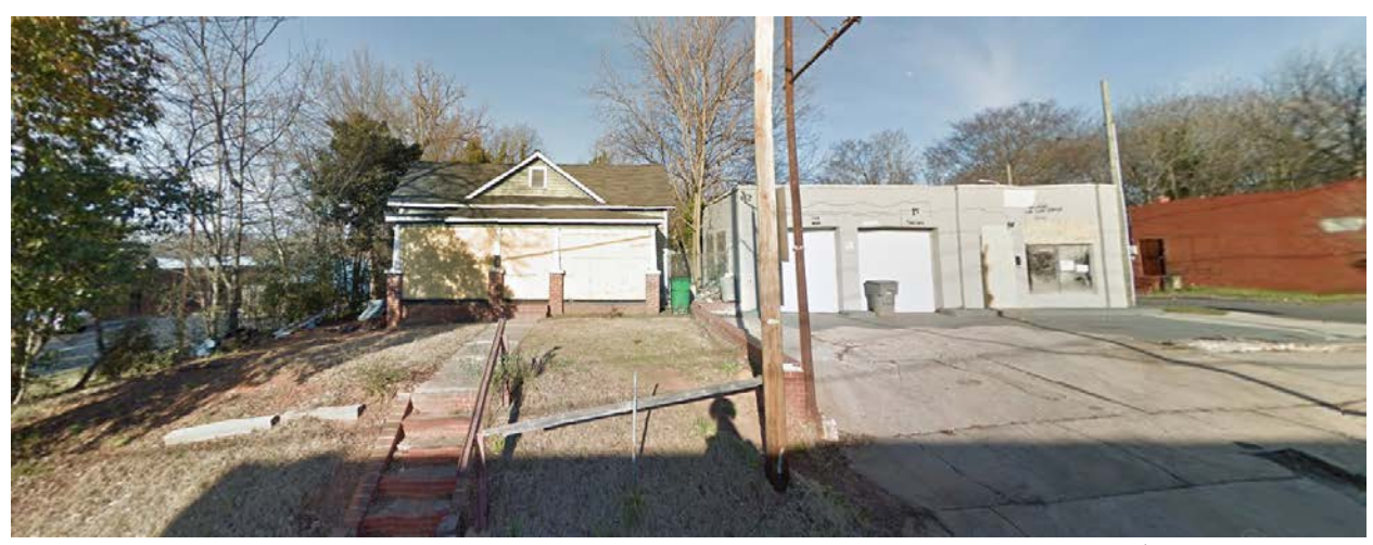
923 Belmont Avenue – A service garage and single family home are located in B-1 (neighborhood business).