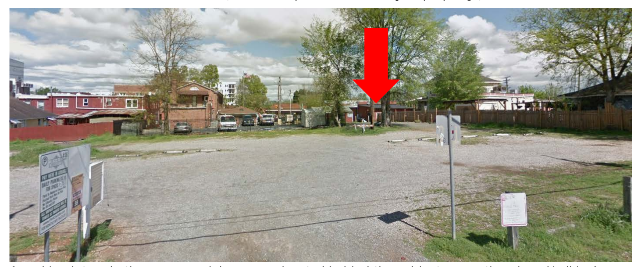
A parking lot and other commercial uses are located behind the subject properties along Yadkin Avenue. (Red arrow points to the subject property.)