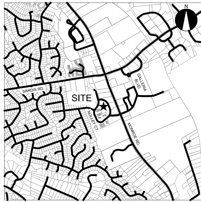
VICINITY MAP SCALE: NTS