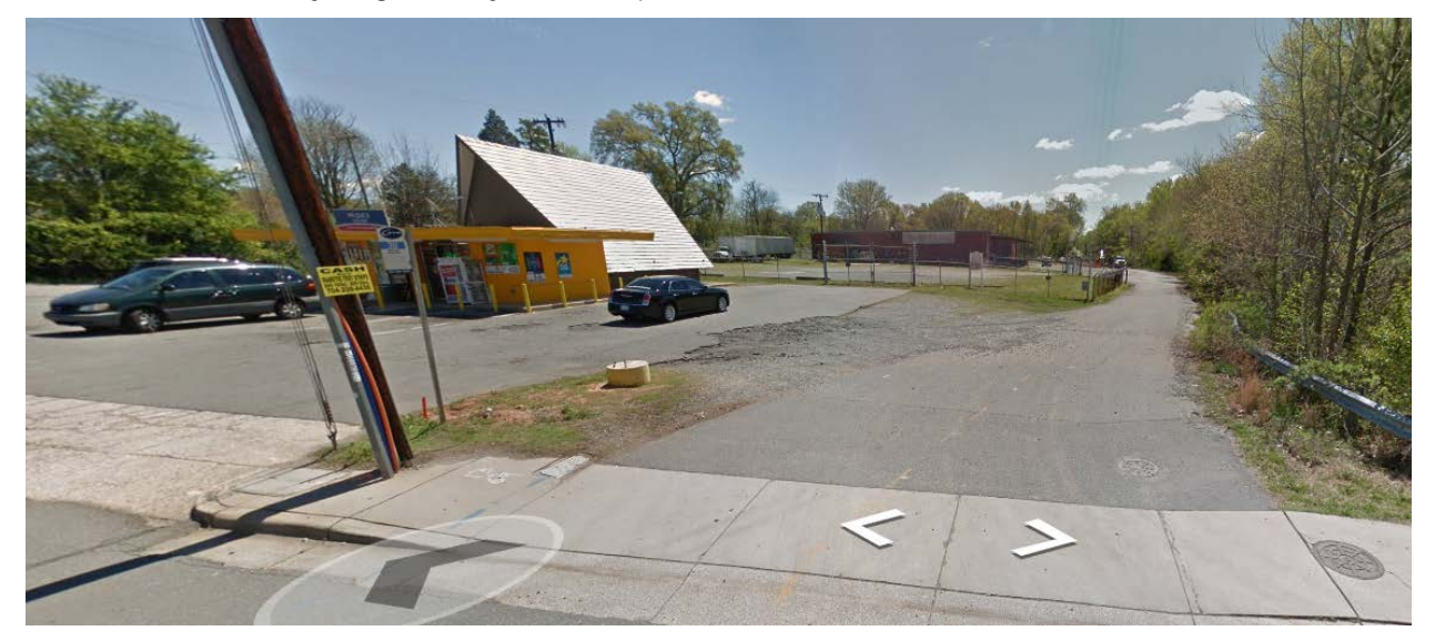
The subject site is developed with a commercial building with access from South Hoskins Road. There is a convenience store in front of the site.

• The site is developed with a 19,080 square foot building constructed in 1970. The site is surrounded by single family homes, apartments, and commercial and institutional uses.