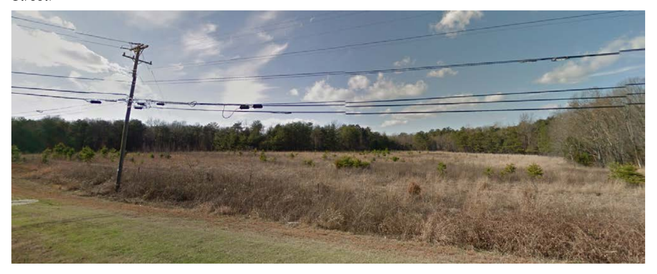
Properties to the northwest are part of the McDowell Nature Preserve.