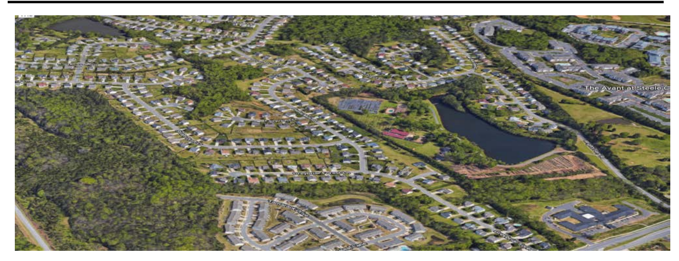
Properties to the northeast across South Tryon Street are developed with multi-family and single family homes.