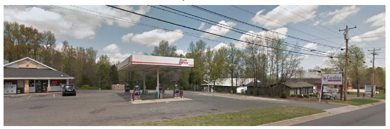
A mix of commercial and retail uses are located to the north of the subject property on South Tryon Street.