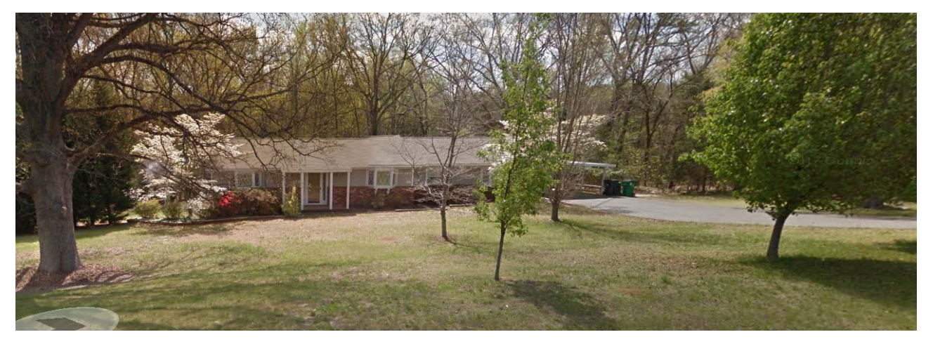
The subject property is developed with single family homes and the remainder of the tract is vacant.

• A portion of the site is developed with residential homes on large lots and the remainder is vacant. The site is immediately surrounded by retail uses, single family homes, townhomes, and institutional uses.