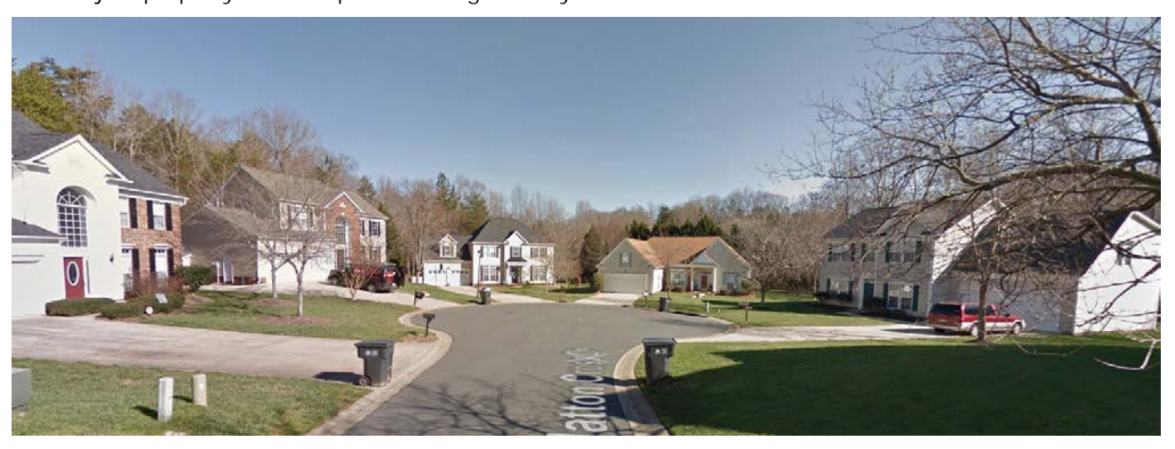
Single family neighborhoods are located to the south and east of the subject property.