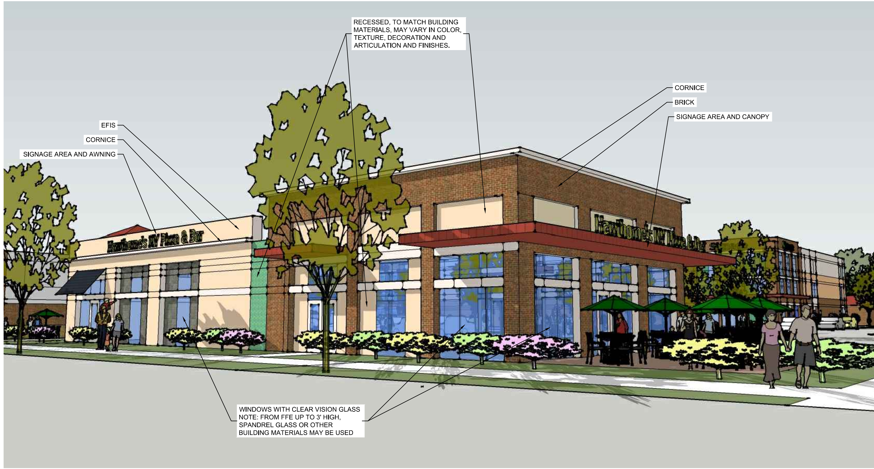
ILLUSTRATIVE RENDERING 3 - BUILDING "A", ROCKY RIVER ROAD FRONTAGE