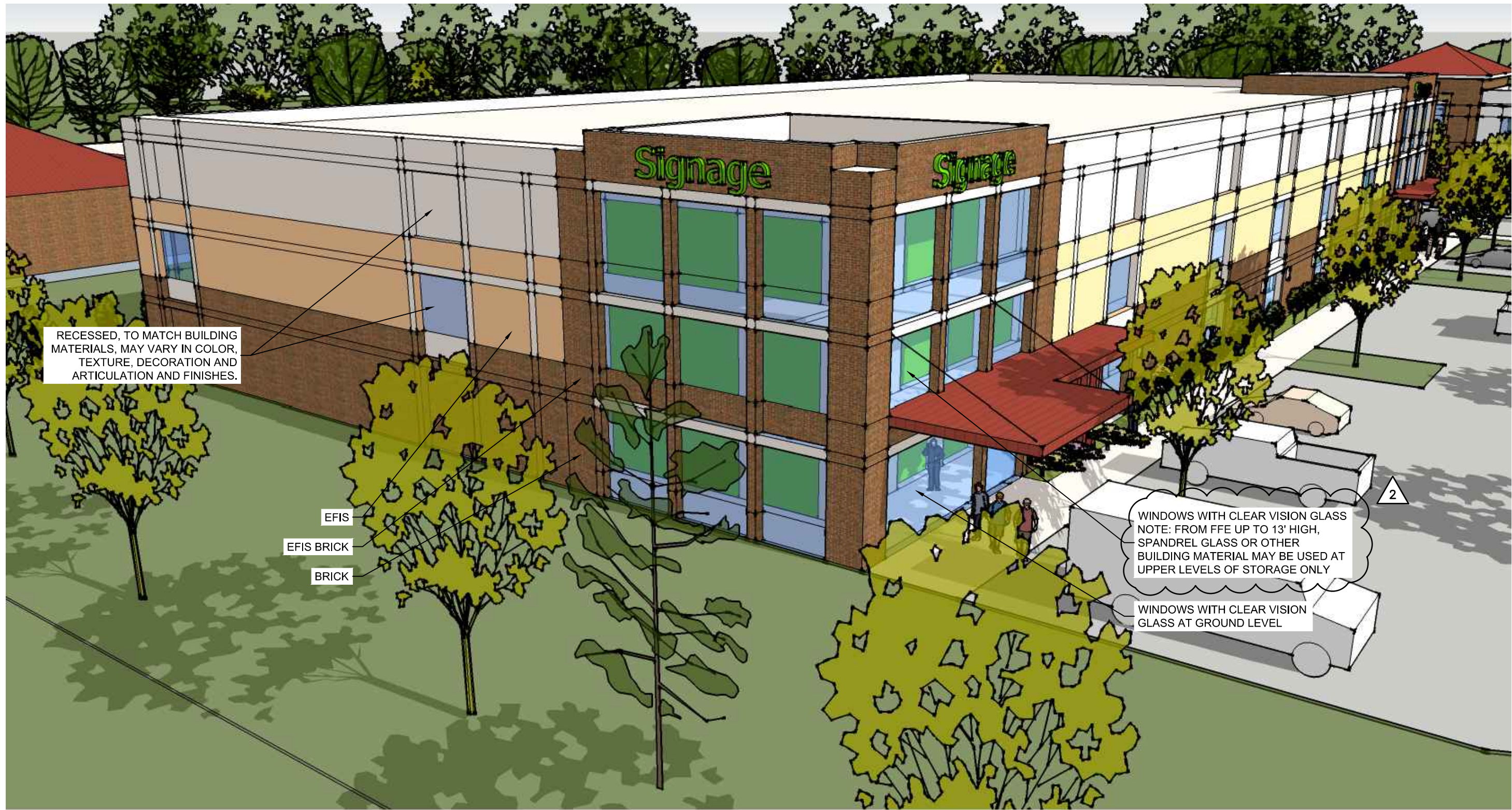
ILLUSTRATIVE RENDERING 5 - BUILDING "C", W T HARRIS BLVD FRONTAGE VIEW