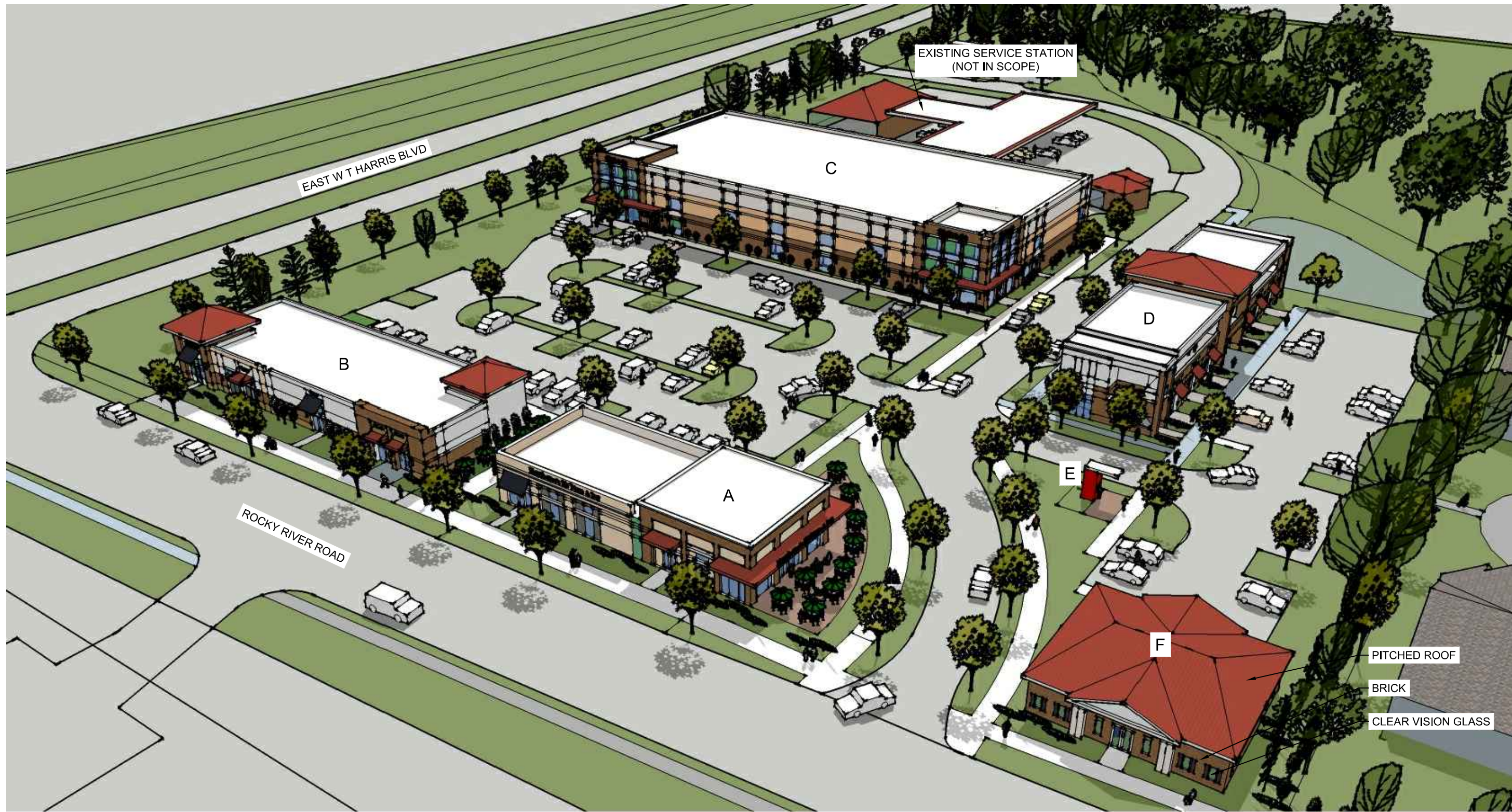
ILLUSTRATIVE RENDERING 1 - OVERALL COMMUNITY VIEW