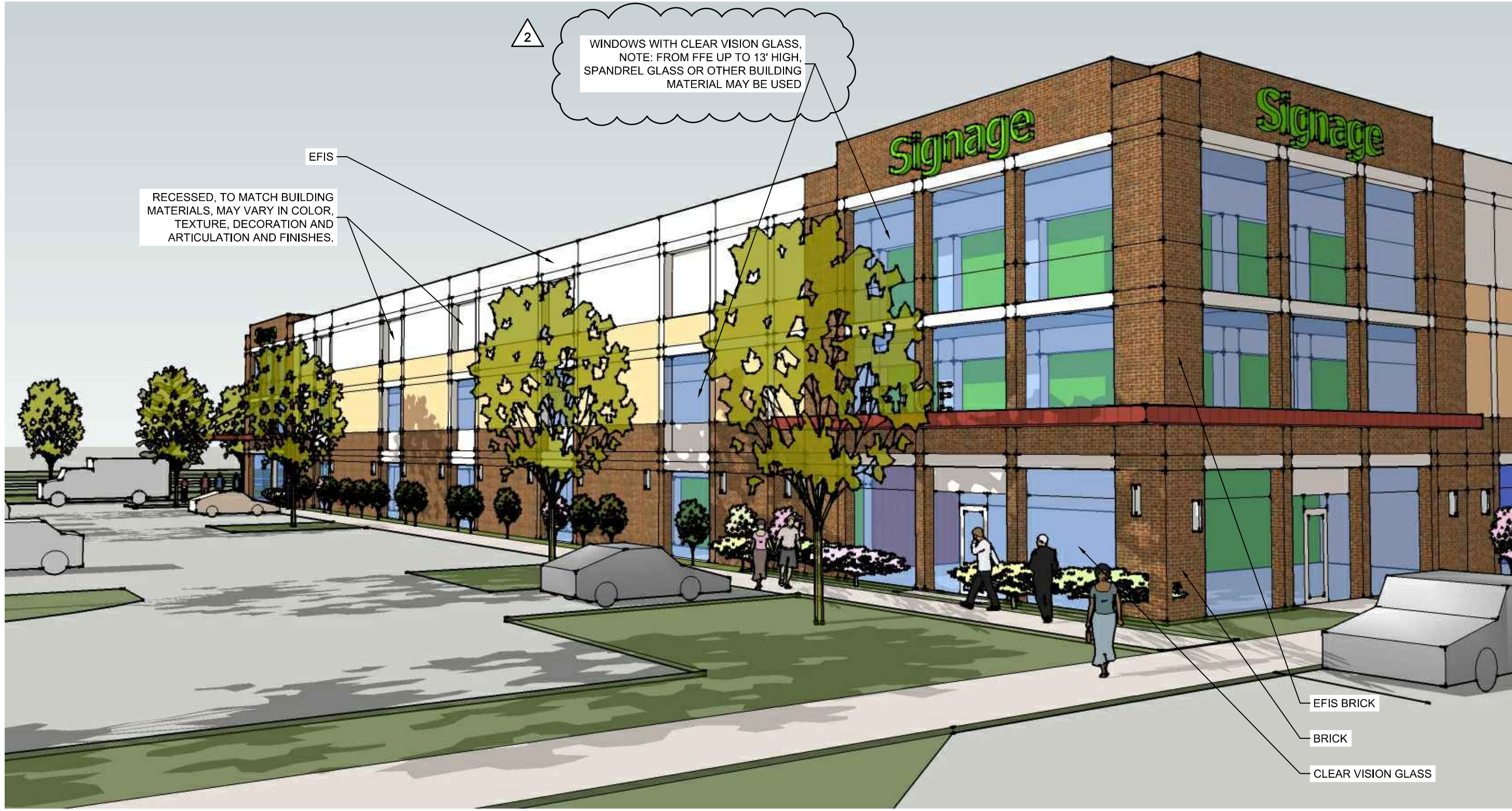
ILLUSTRATIVE RENDERING 4 - BUILDING "C", SHARED PARKING FRONTAGE VIEW