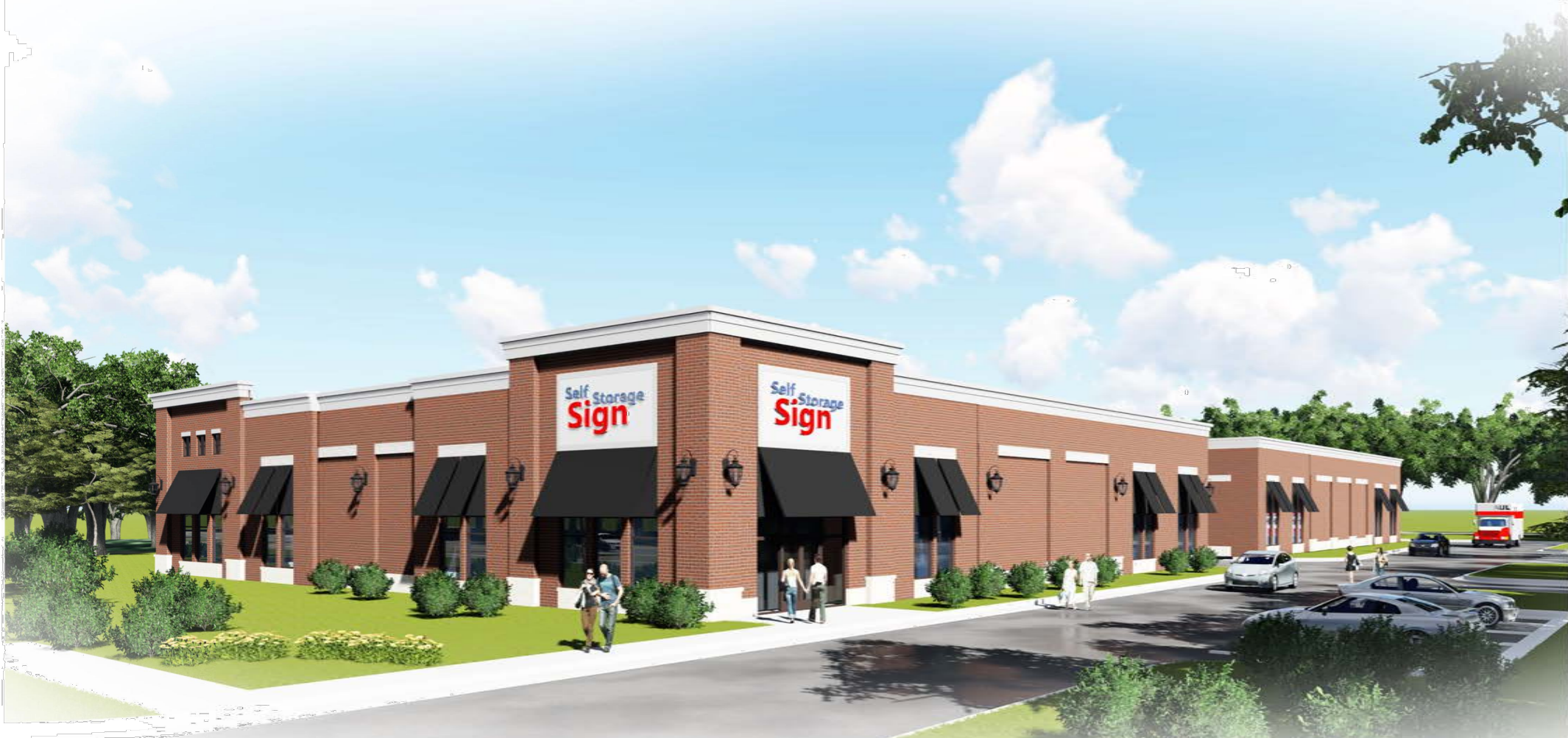
PERSPECTIVE: LOOKING EAST