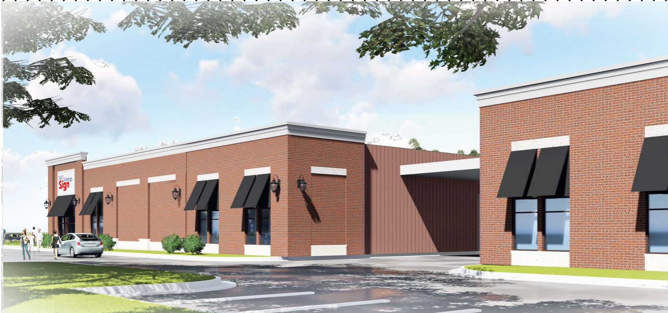
PERSPECTIVE: LOOKING NORTH