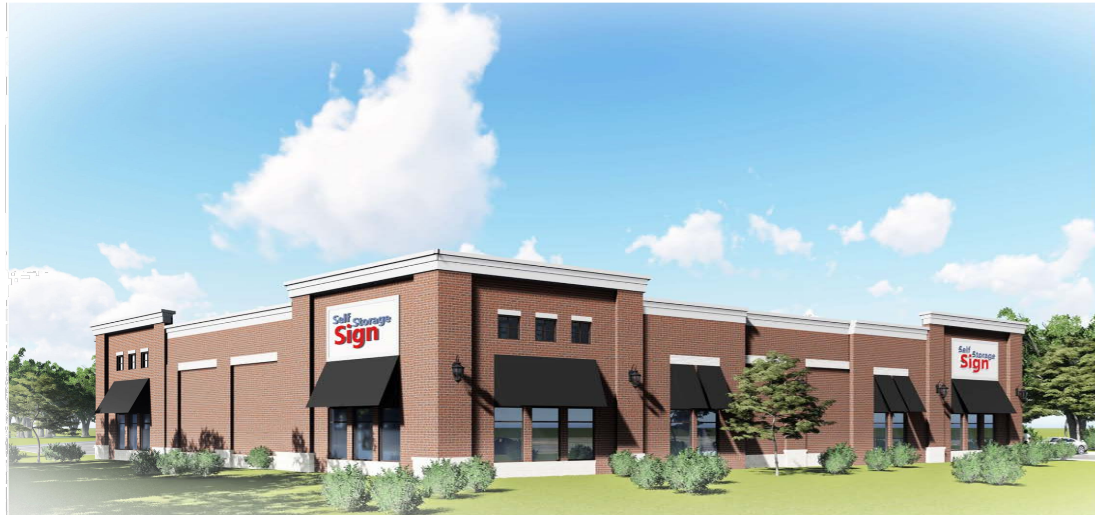
PERSPECTIVE: LOOKING SOUTH