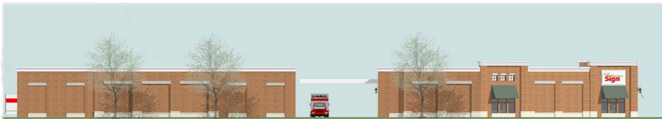
PROPOSED NORTH/SOUTH ELEVATION, LOOKING WEST