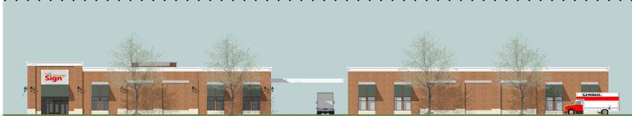
PROPOSED NORTH/SOUTH ELEVATION, LOOKING EAST