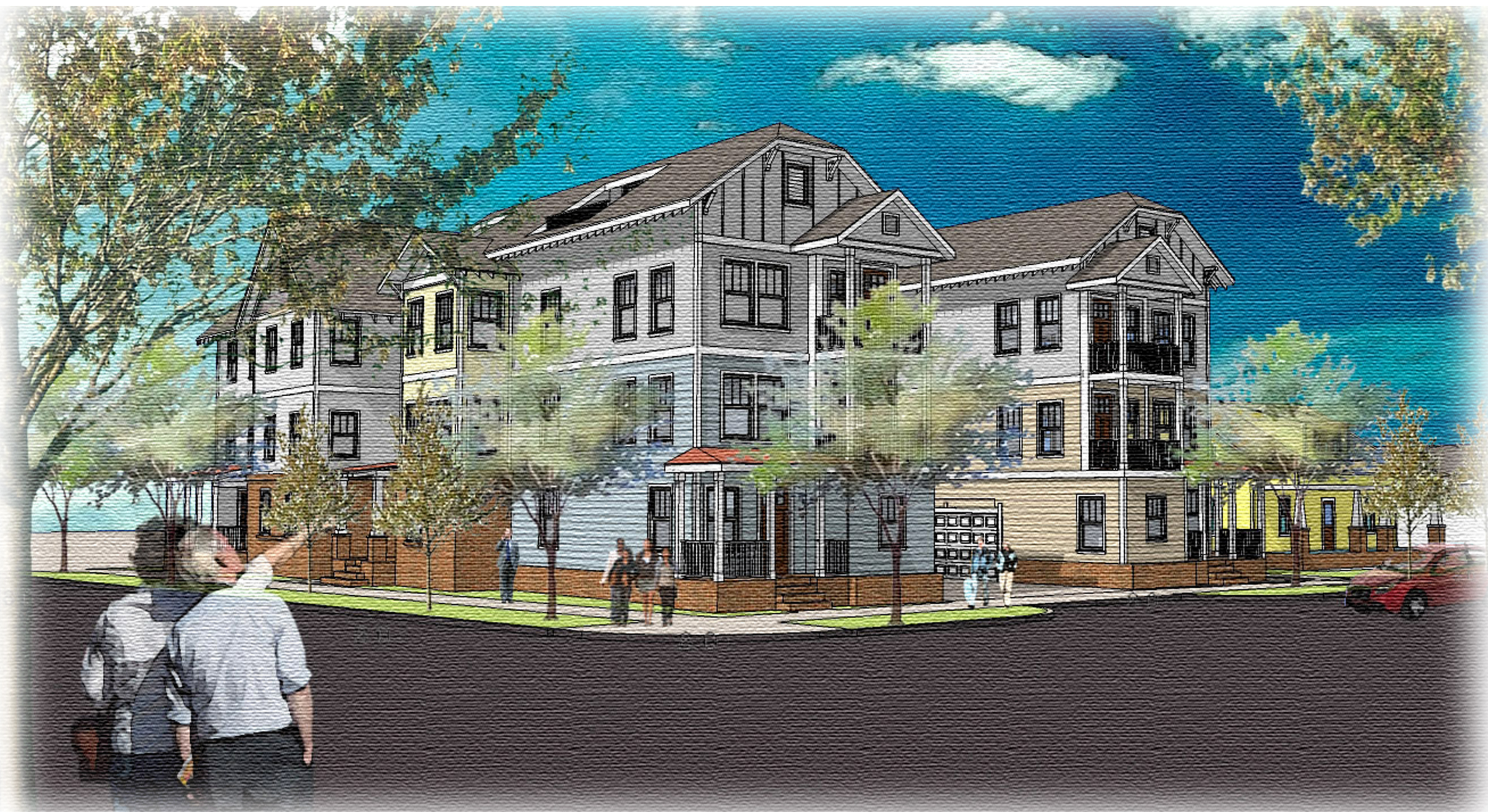
1 INTERSECTION AT S. SYCAMORE & MARGARET BROWN Not To Scale