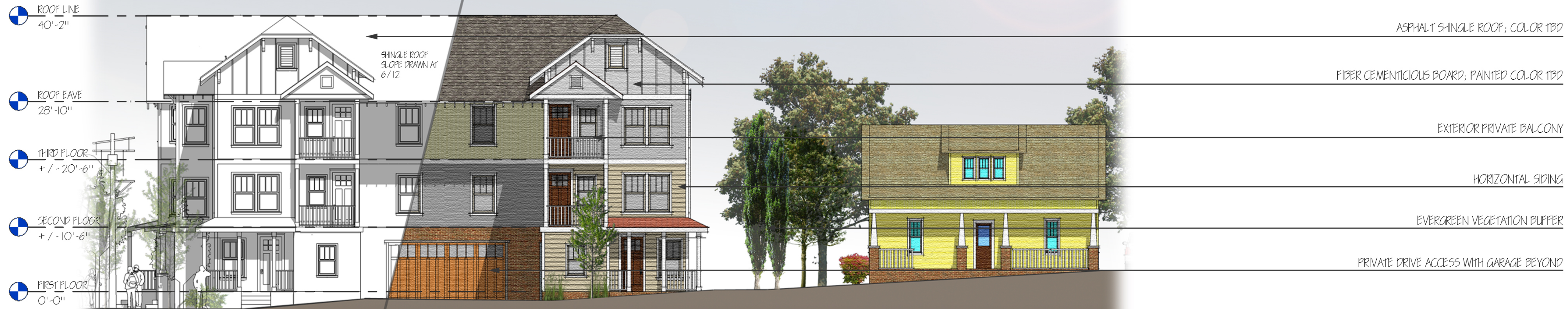
1 MARGARET BROWN ELEVATION SCALE: 1/8" = 1'0"

1016 MARGARET BROWN ST. EXISTING SINGLE FAMILY HOME FOR REFERENCE