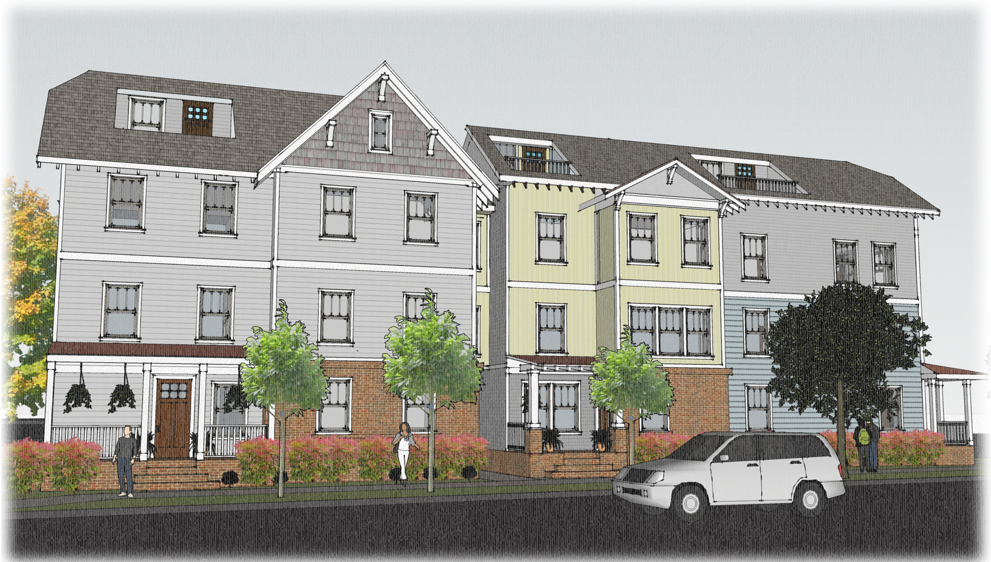
2 VIEW ALONG S. SYCAMORE STREET Not To Scale