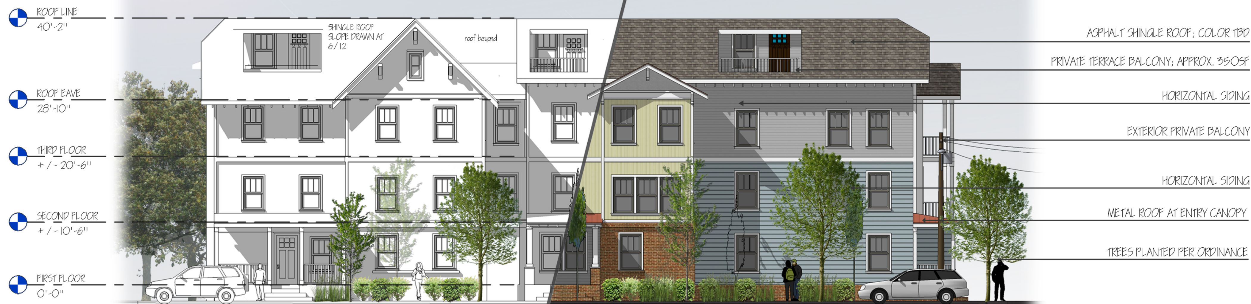
2 SOUTH SYCAMORE ELEVATION SCALE: 1/8" = 1'0"

1016 MARGARET BROWN ST. EXISTING SINGLE FAMILY HOME FOR REFERENCE