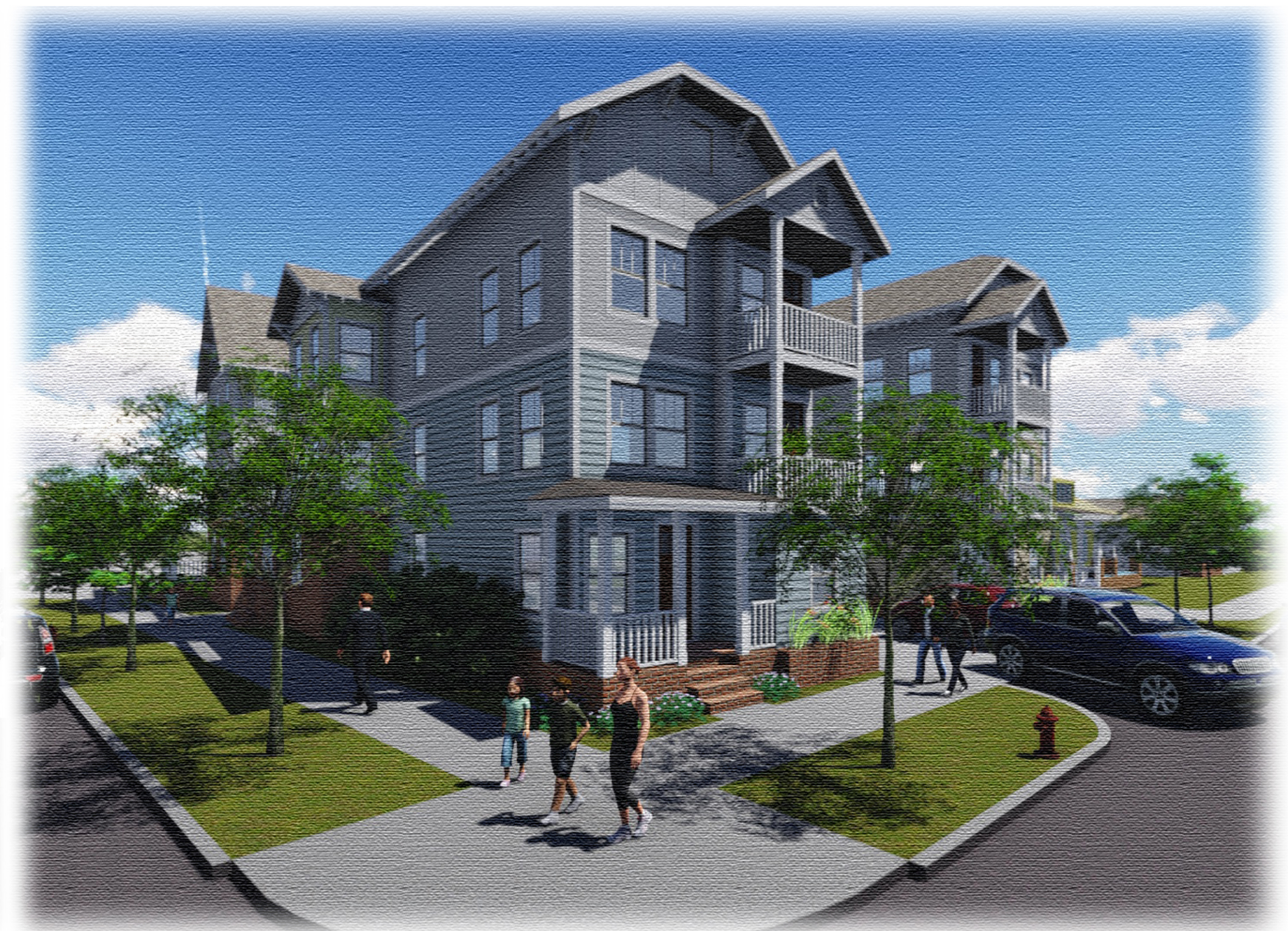
3 MARGARET BROWN FACADE PERSPECTIVE Not To Scale