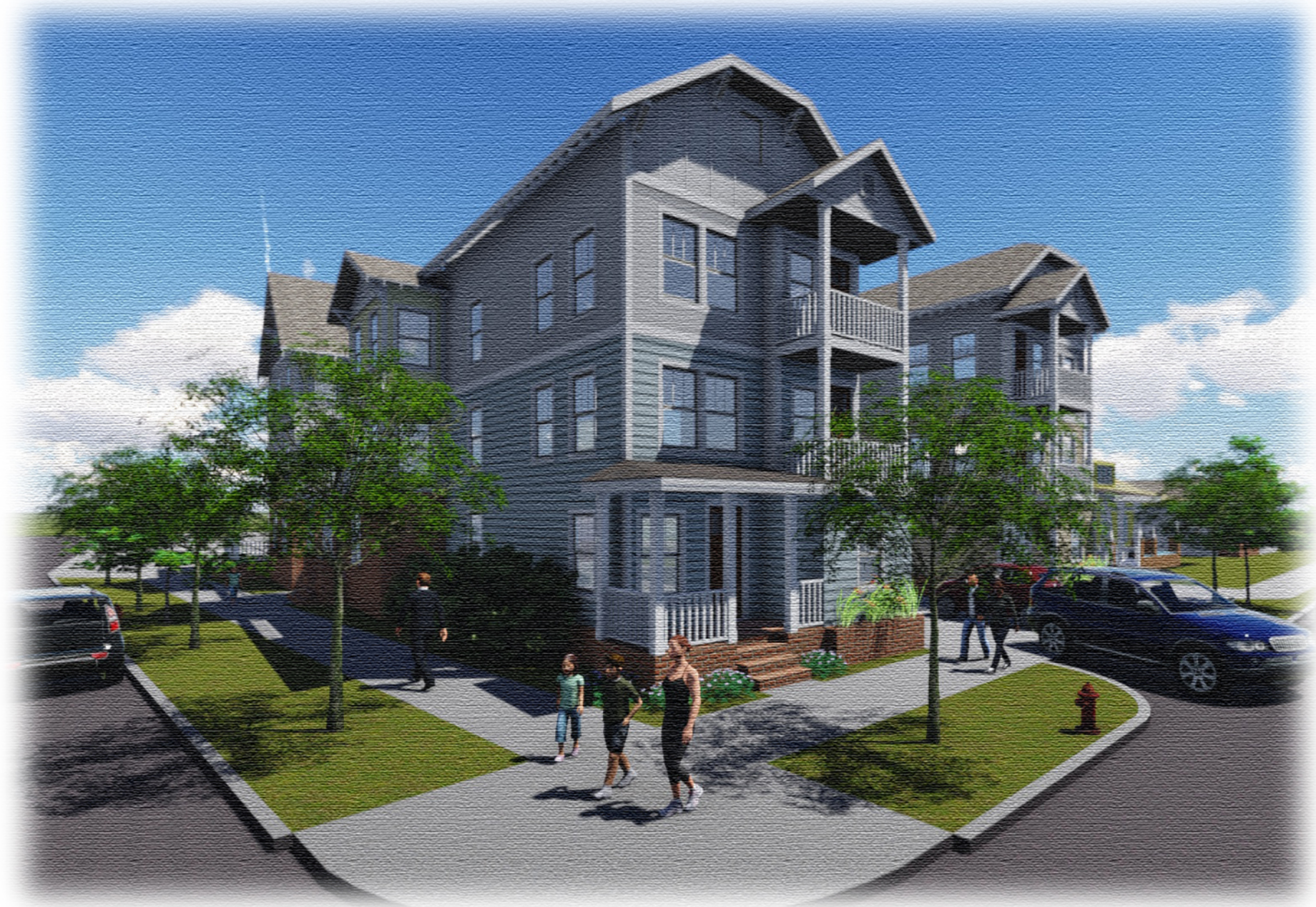
3 SYCAMORE + MARGARET BROWN INTERSECTION SCALE: 1/8" = 1'0"

GEOSCIENCE GROUP 10000 Peachtree Road Atlanta, GA 30327 Phone: 770.452.3003 www.geosciencegroup.com