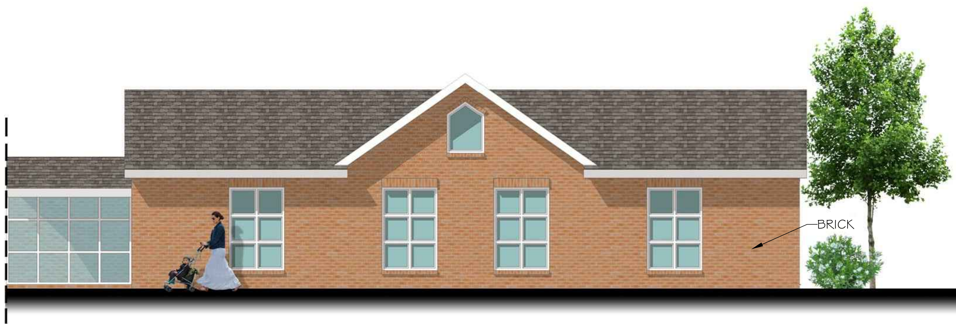
OFFICE ADDITION - WEST ELEVATION