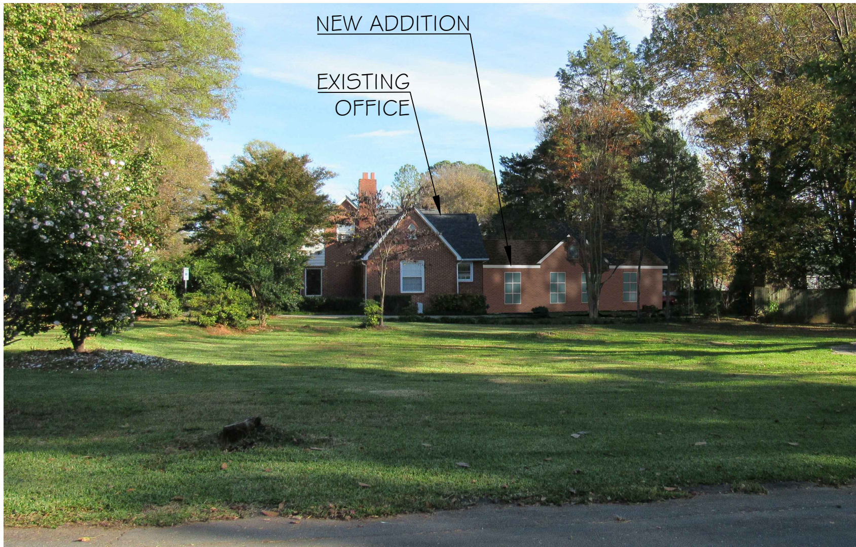
ILLUSTRATIVE VIEW OF THE DENTAL OFFICE ADDITION'S WEST ELEVATION FROM CRYSTAL RD.