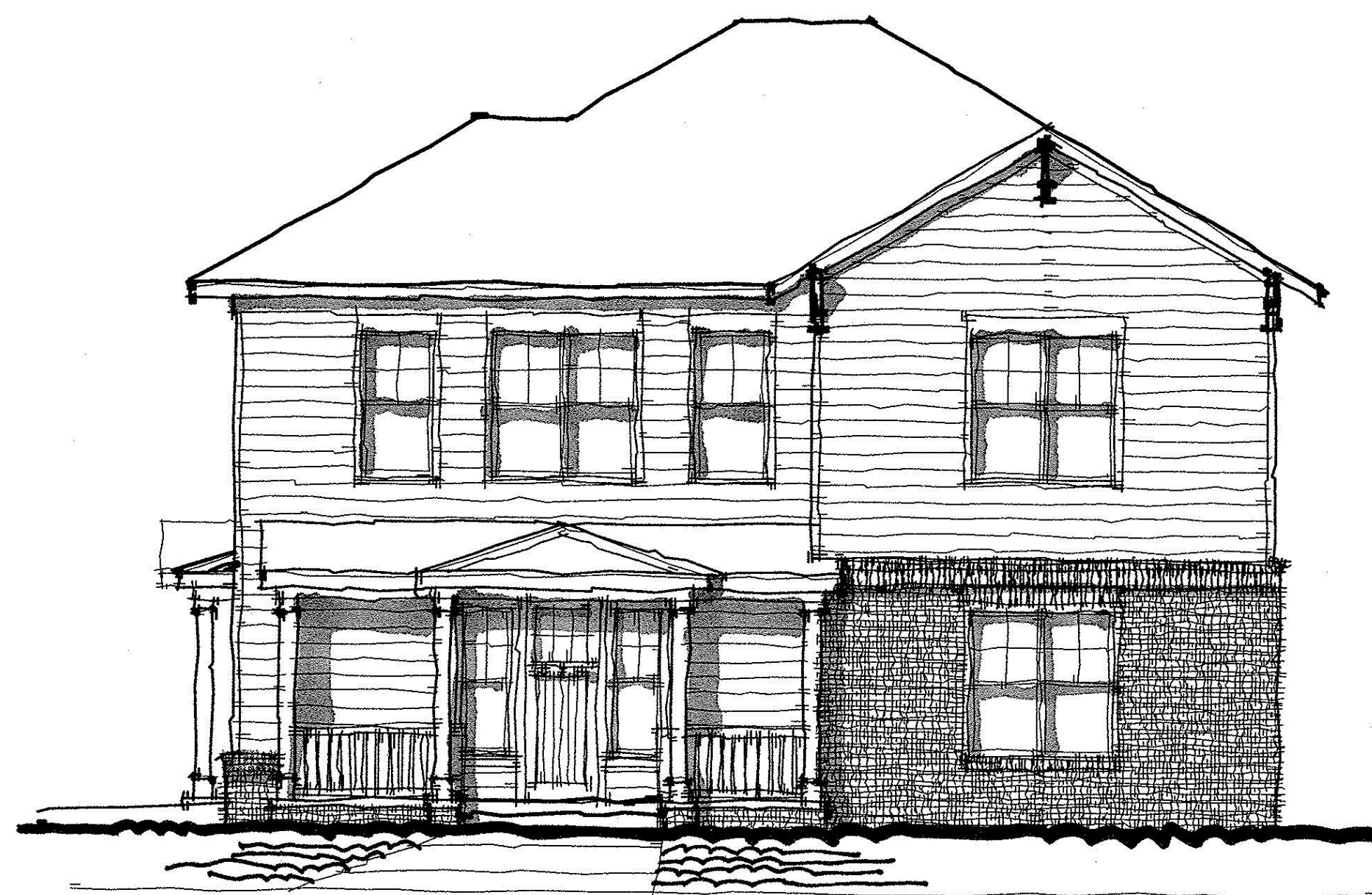
3 BUILDING A - FRONT ELEVATION RZ2