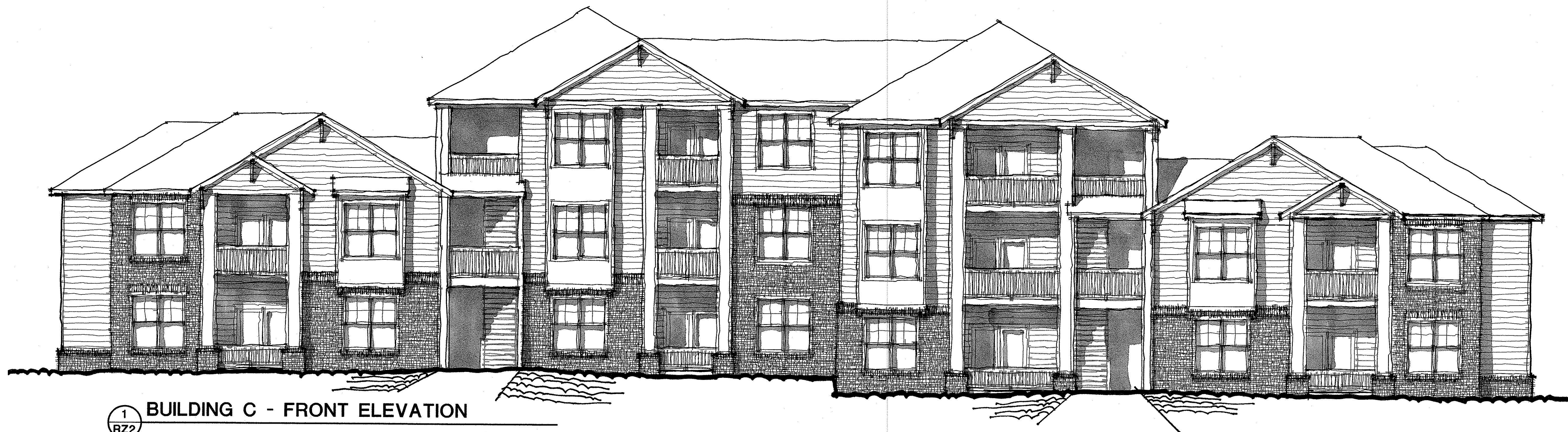
1 BUILDING C - FRONT ELEVATION RZ2