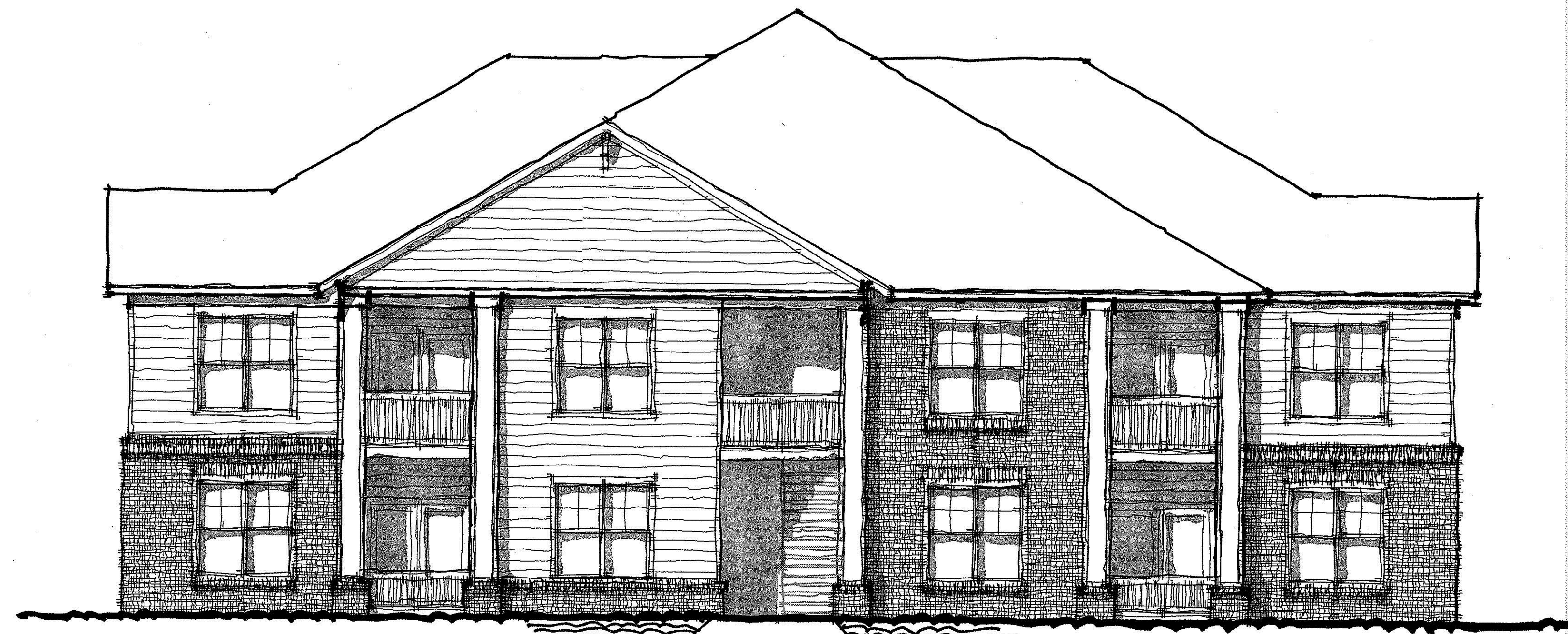
2 BUILDING B - FRONT ELEVATION RZ2