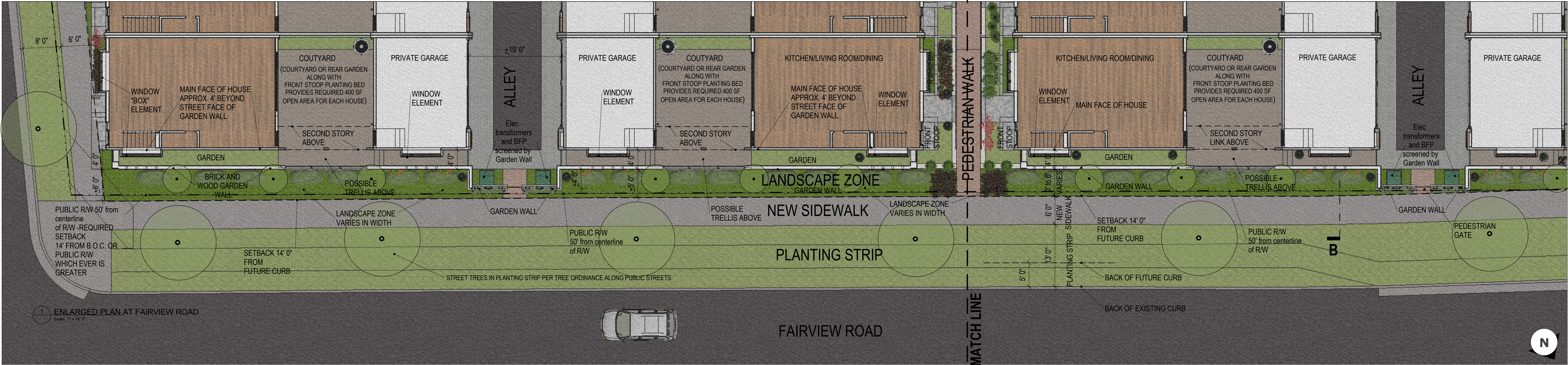
1 ENLARGED PLAN AT FAIRVIEW ROAD Scale: 1" = 10' 0"