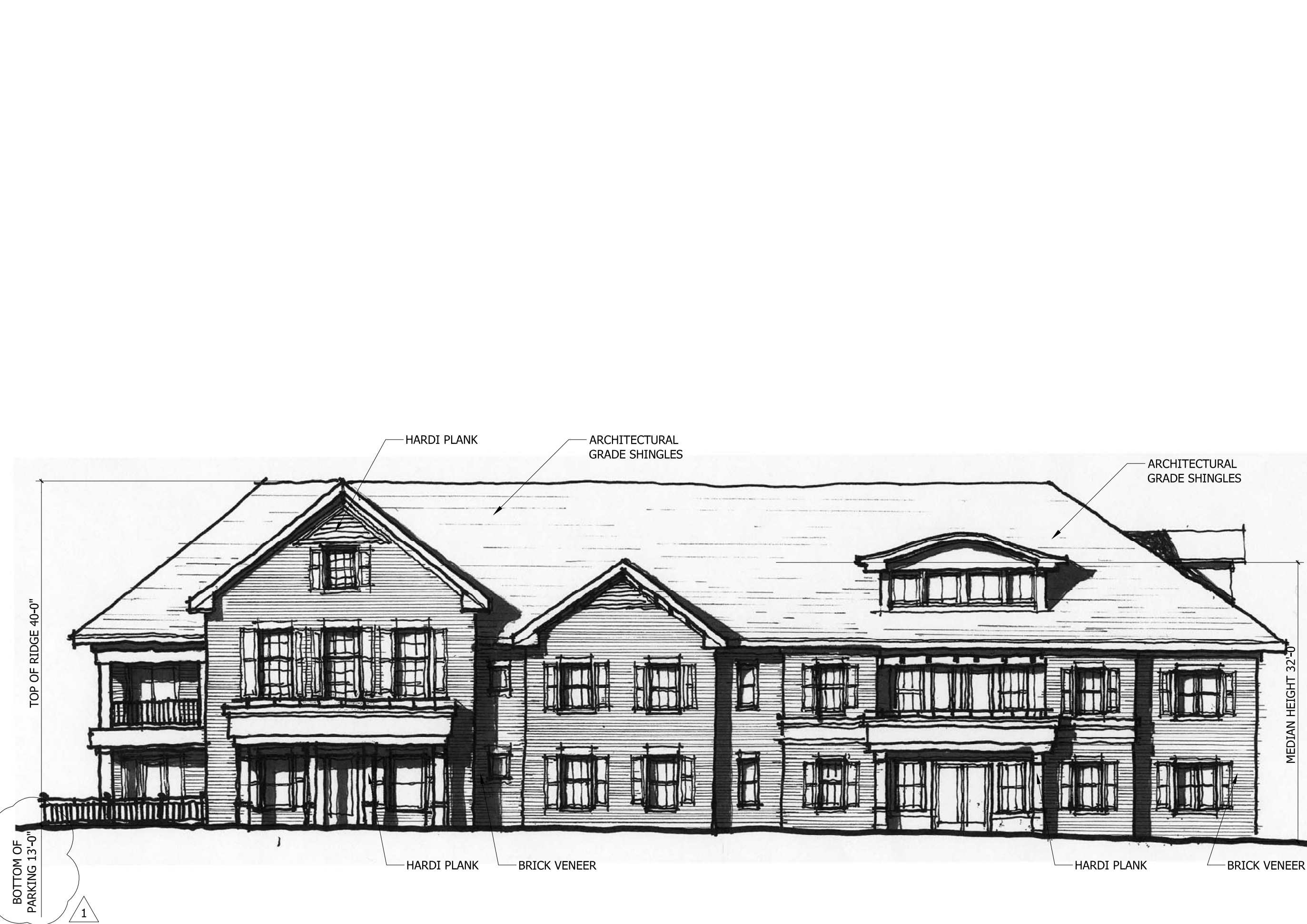
03 BUILDING A FRONT ELEVATION