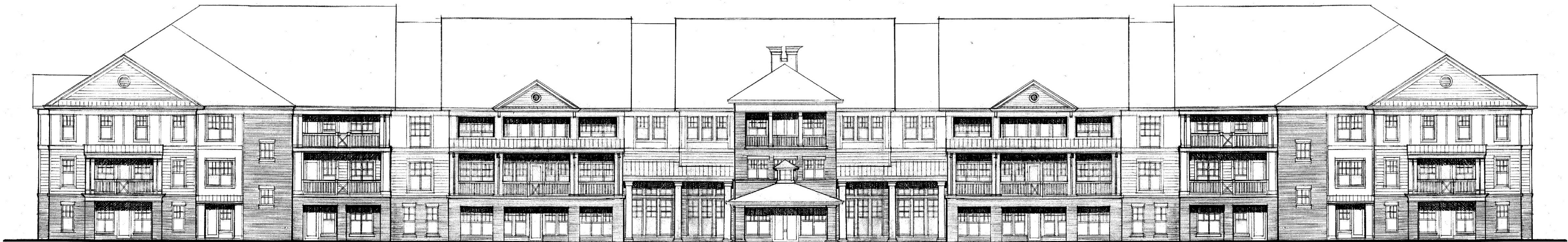
1 COMPLETE ELEVATION - MALLARD CREEK (PENNINGER SIMILAR)