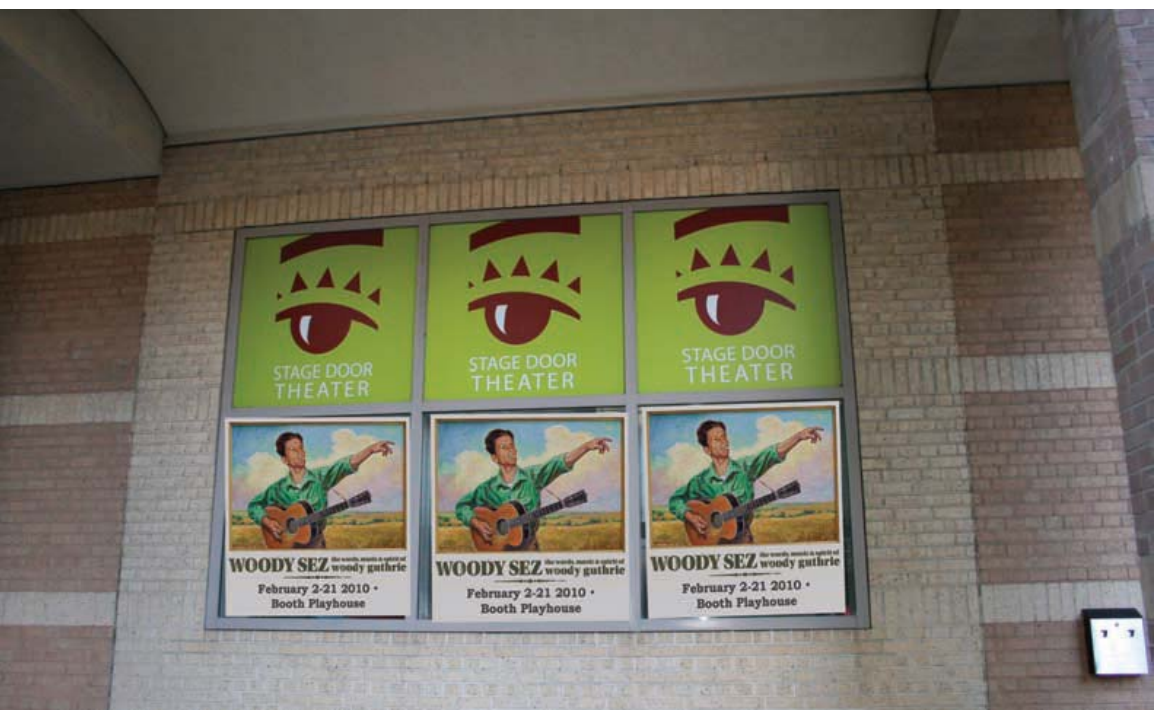
NCBPAC College St. elevation