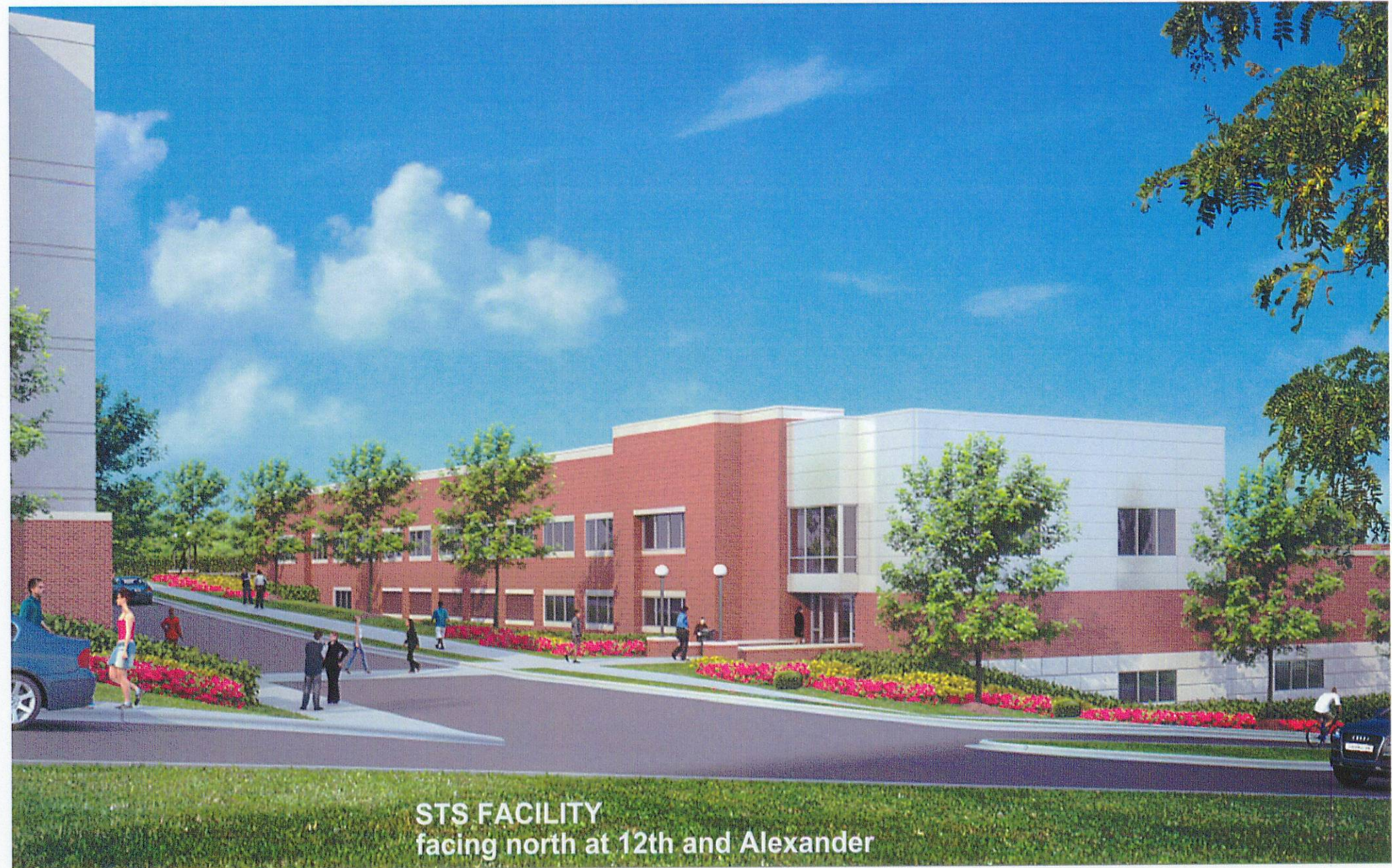
STS FACILITY facing north at 12th and Alexander