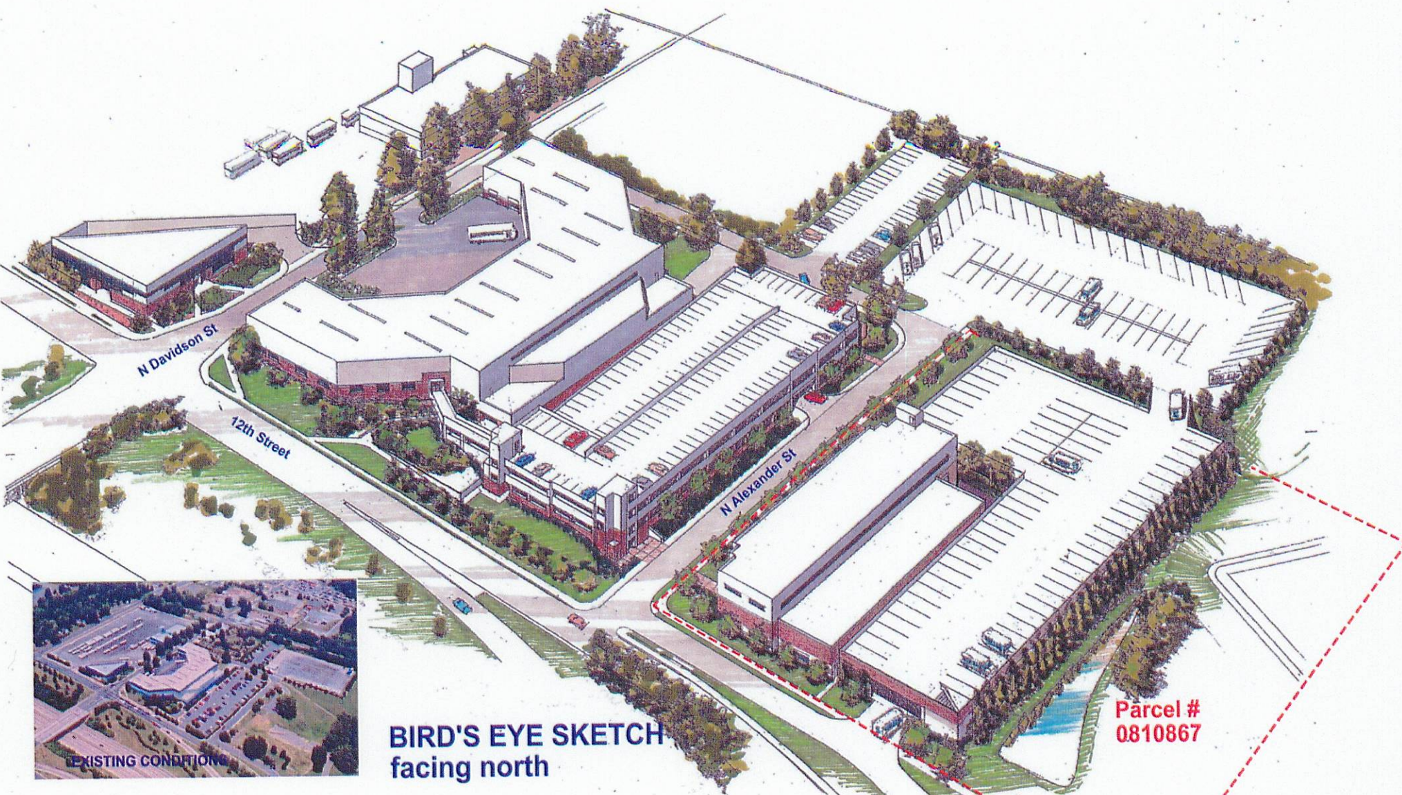
BIRD'S EYE SKETCH facing north