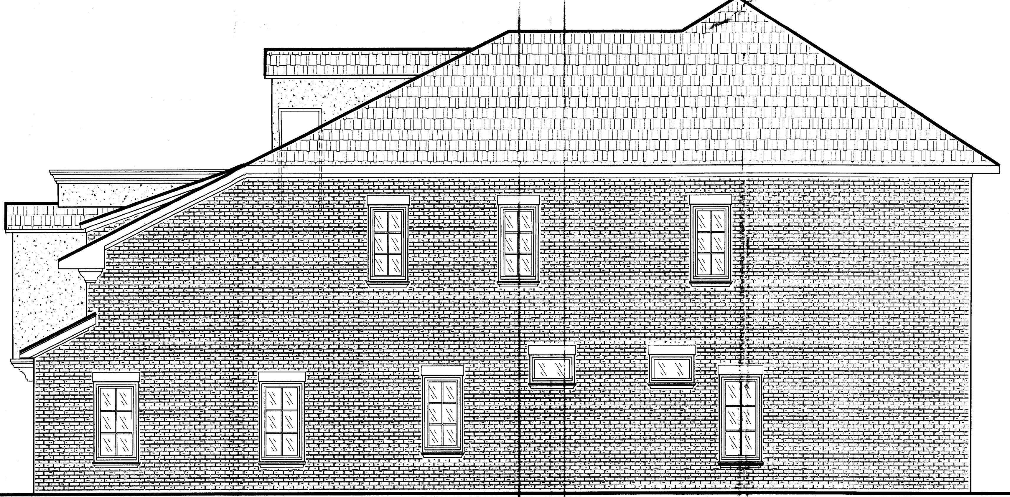
RIGHT VIEW (END UNIT INSIDE DEVELOPMENT)

SAGRADO VILLAS AT BALLANTYNE NOVEMBER 2, 2007