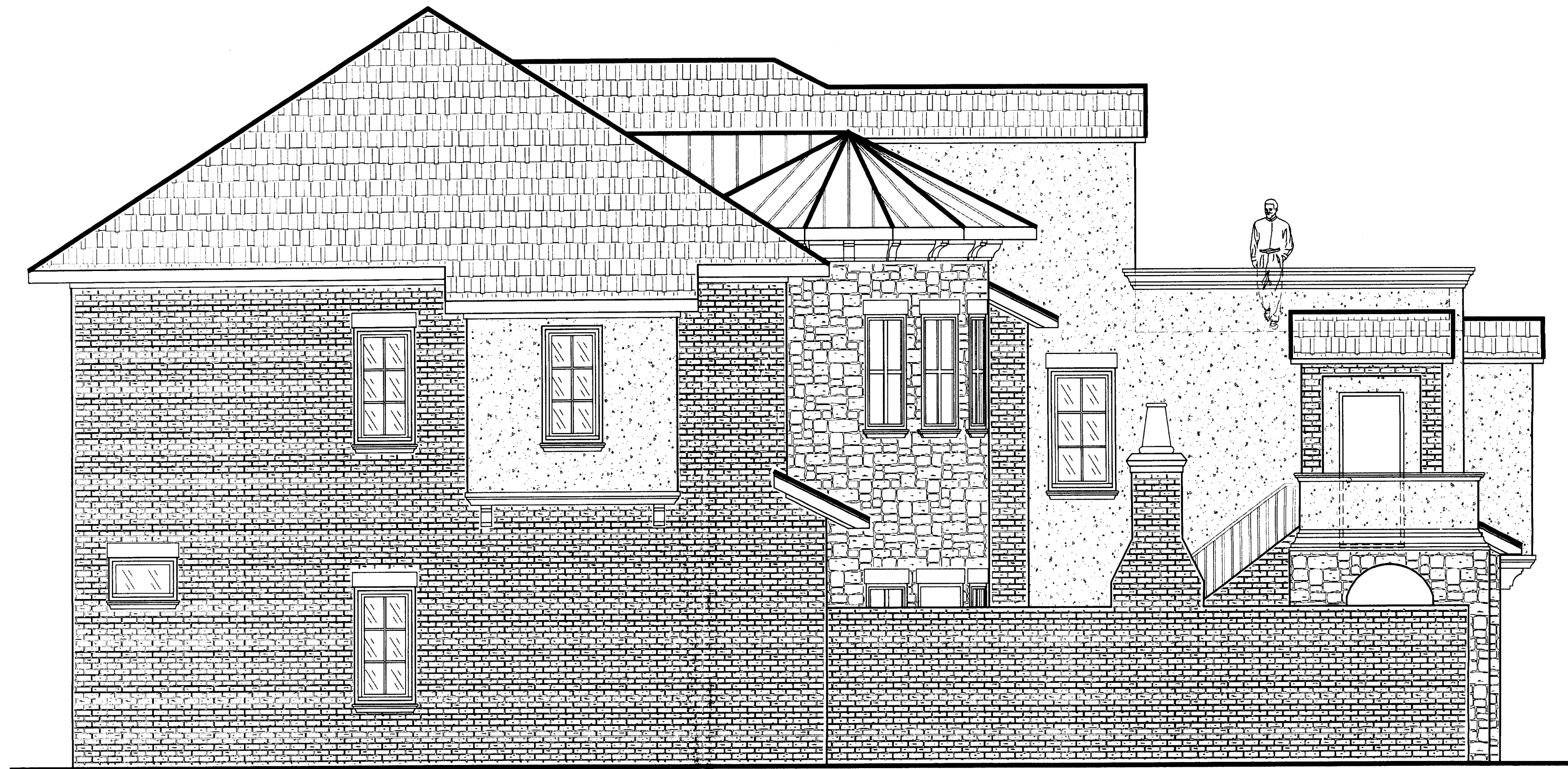
LEFT VIEW (END UNIT MAIN ROAD SIDE)