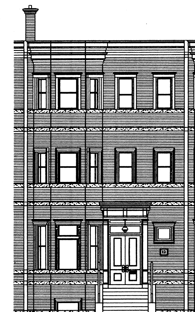
TYPICAL UNIT ELEVATION SEE NOTE 23

Petition Number: 2008-026 For Public Hearing