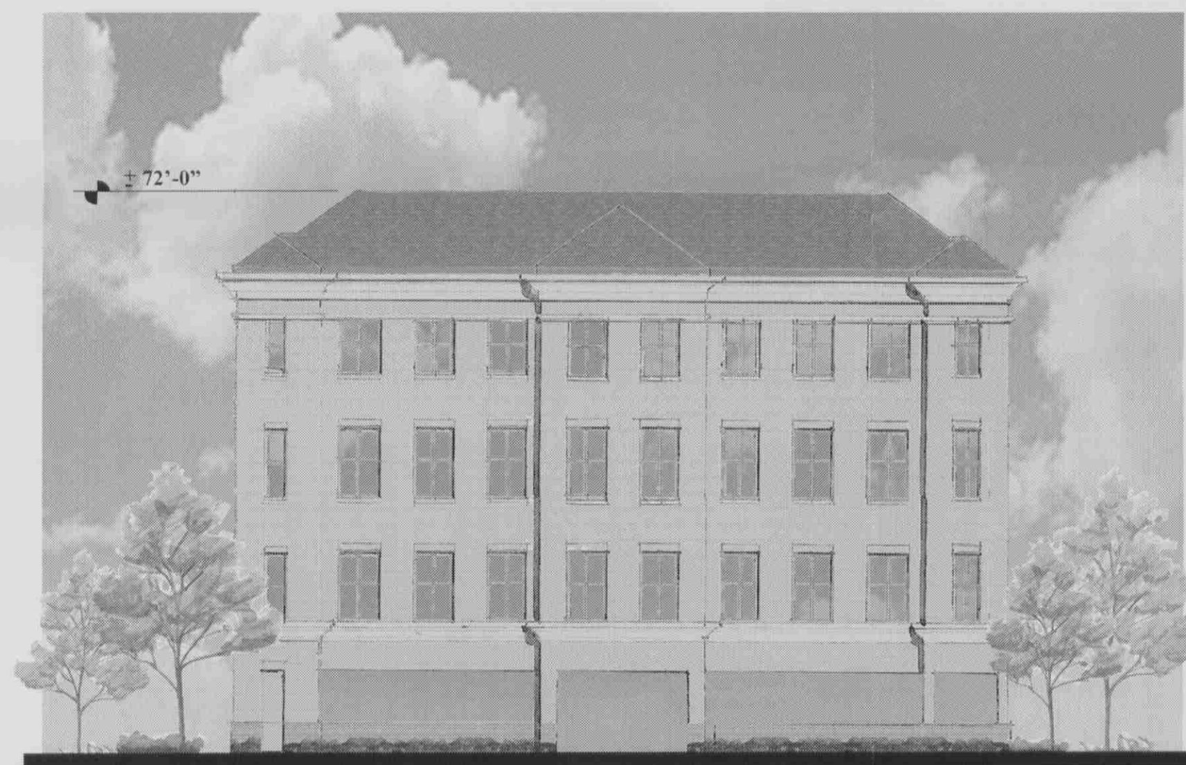
REAR ELEVATION SCALE: 1/16" = 1'-0"