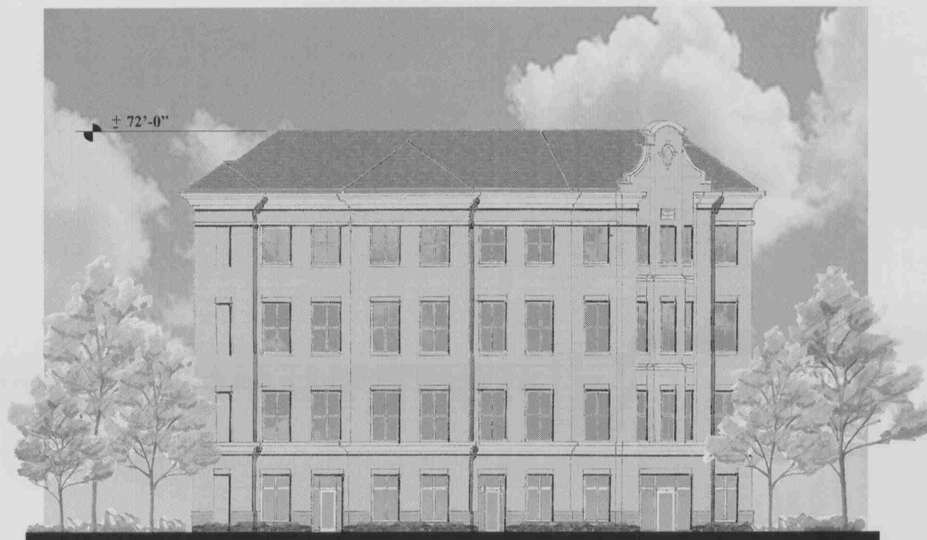
MOREHEAD ELEVATION (FRONT) SCALE: 1/16" = 1'-0"