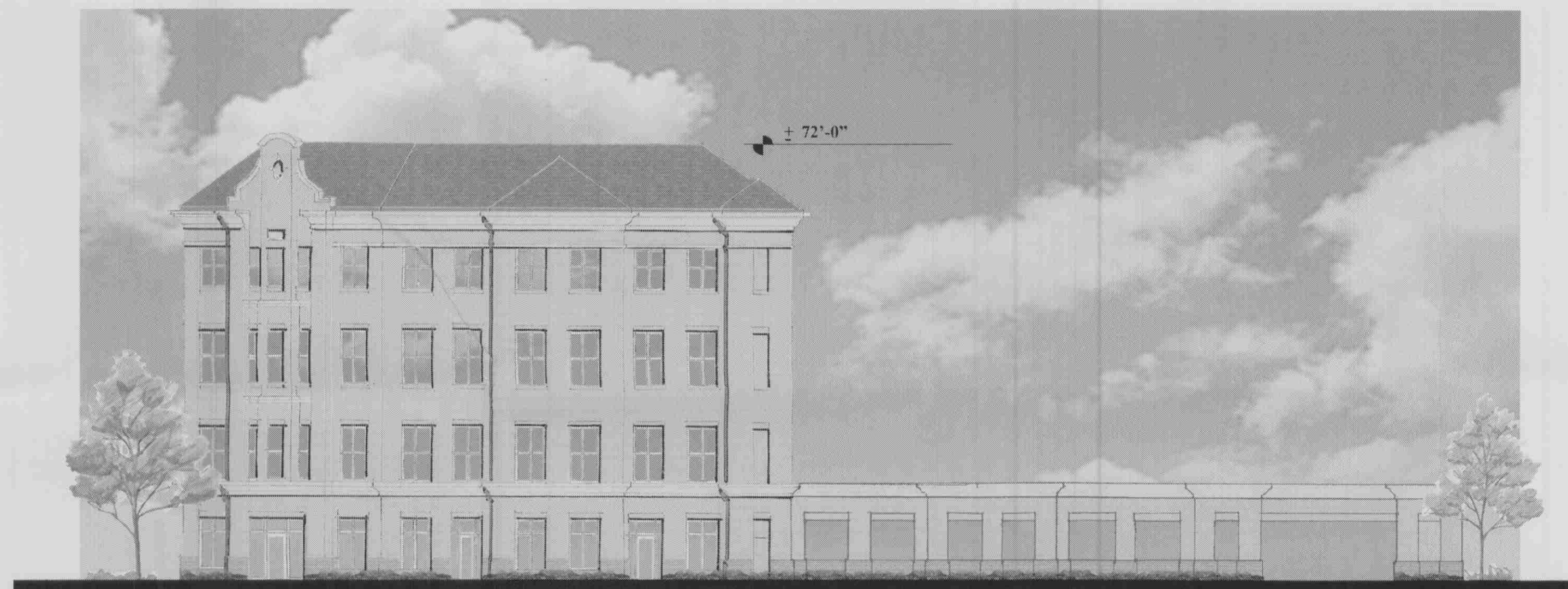
EUCLID ELEVATION (RIGHT SIDE) SCALE: 1/16" = 1'-0"