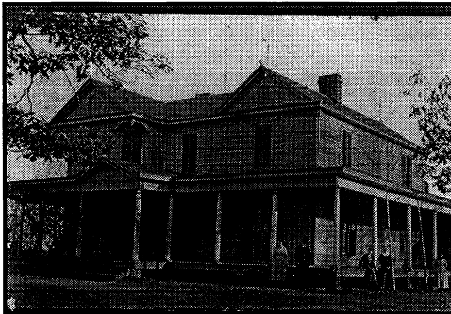
Historic Photograph of James A. Blakeney House