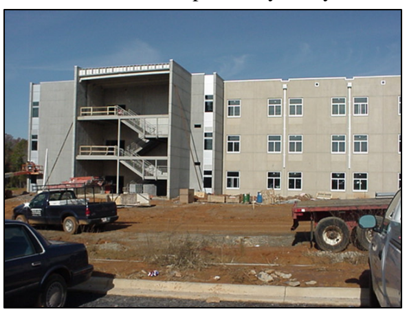
Ardrey Kell High School

The local governmental agencies within Charlotte and Mecklenburg County responsible for the construction and maintenance of infrastructure (notably Charlotte-Mecklenburg Schools, the City Department of Transportation, Charlotte Mecklenburg Utility Department, and Mecklenburg Park & Recreation) typically develop long-range facilities needs assessments and master plans based upon generally-accepted growth projections and established infrastructure levels of service. Additionally, a ten-year Capital Needs Assessment is developed every two years: in even-numbered years for City agencies and