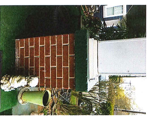
Front Steps - Right