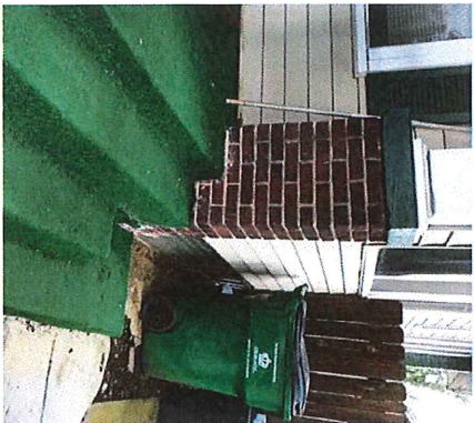
Side Steps - Right