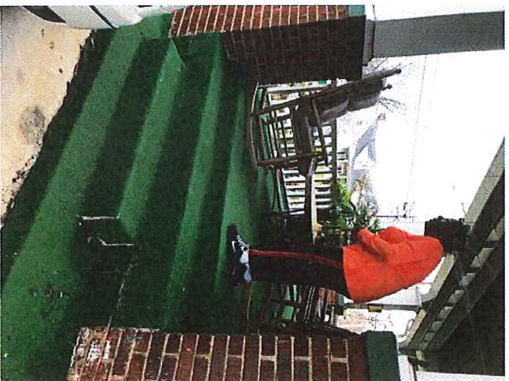
Side Steps - Left