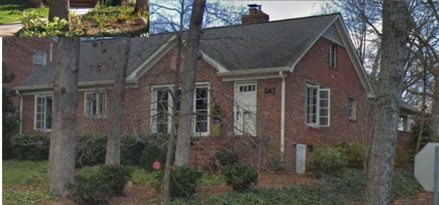
943 Romany Road 2019