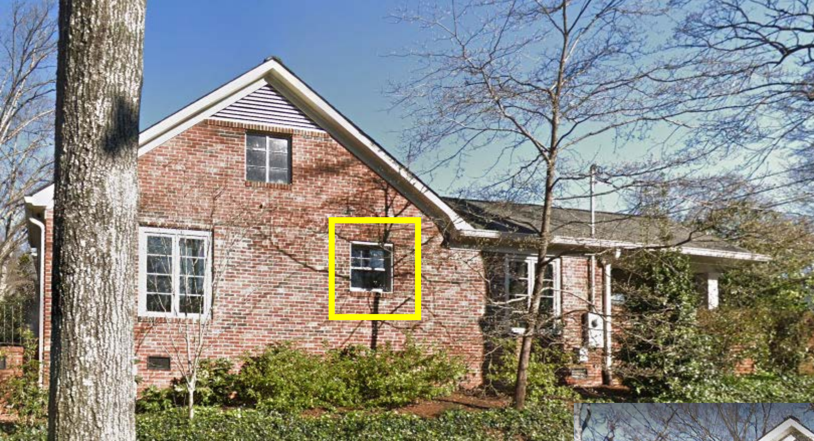
943 Romany Road Right Elevation – Lexington Avenue 2019