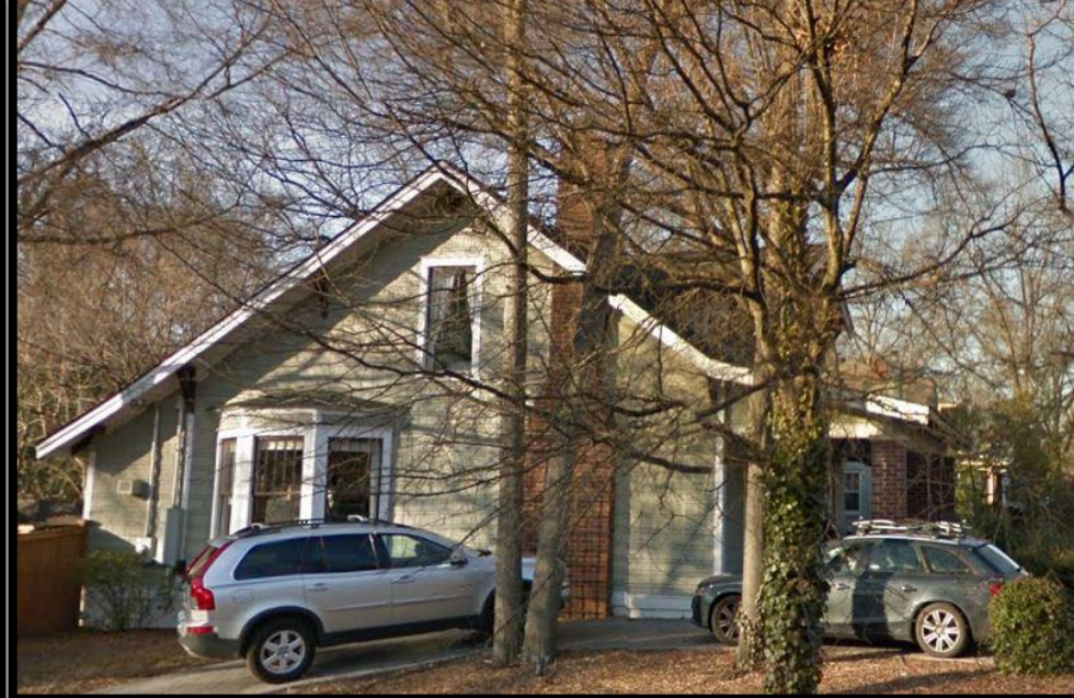
House before The brick is painted