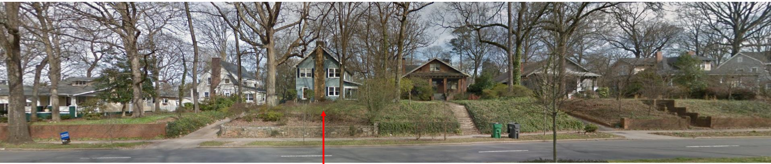
1508 the Plaza