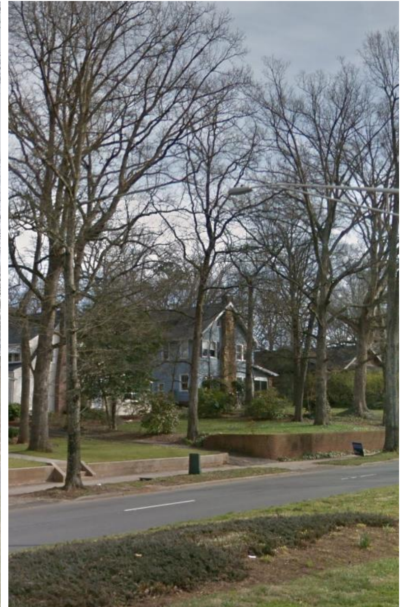
Street View – the Plaza