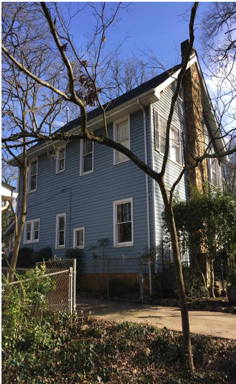
Left Elevation – Towards rear of property