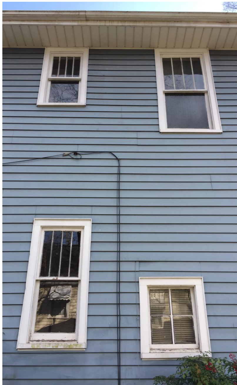
Left Elevation – Straight on