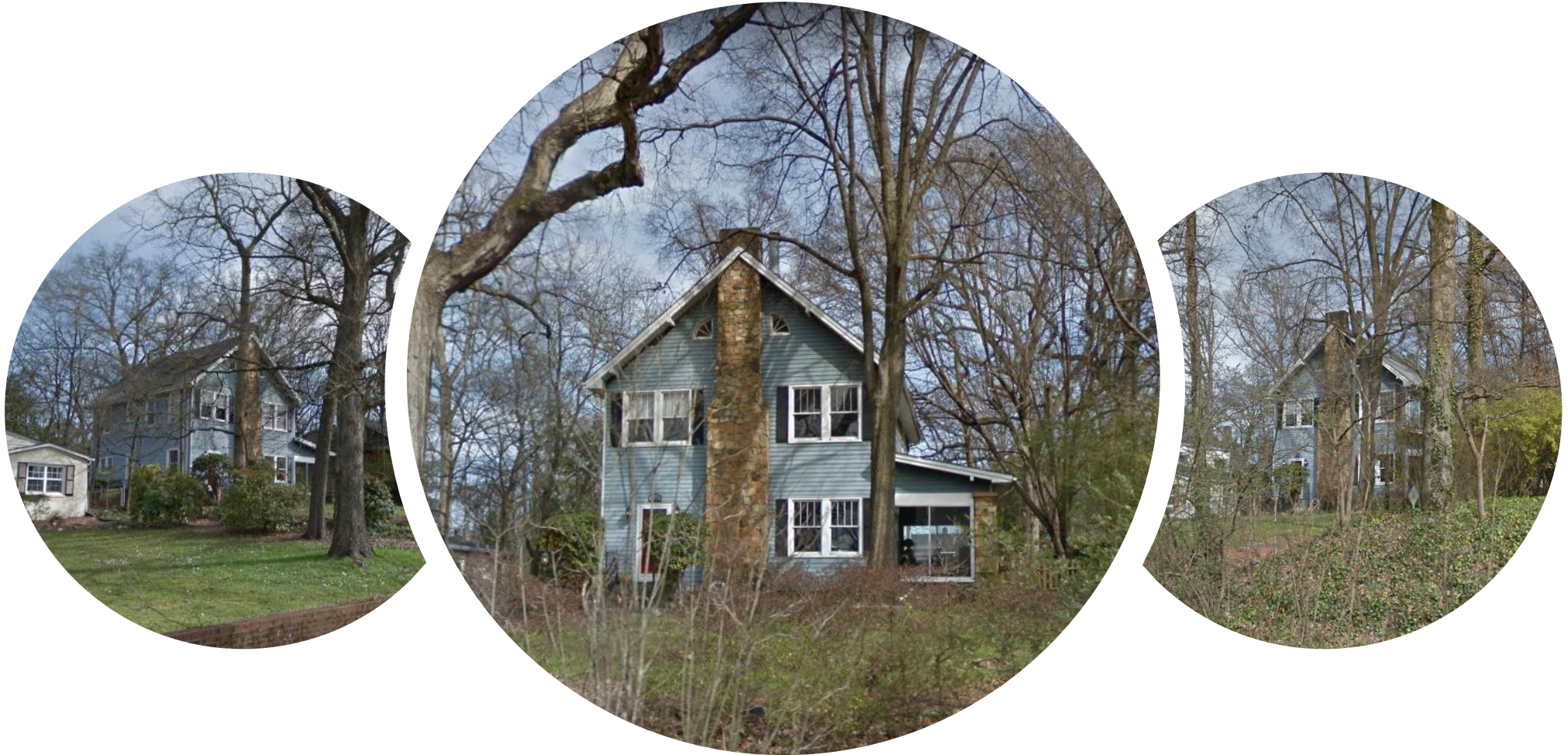
1508 THE PLAZA — PLAZA-MIDWOOD