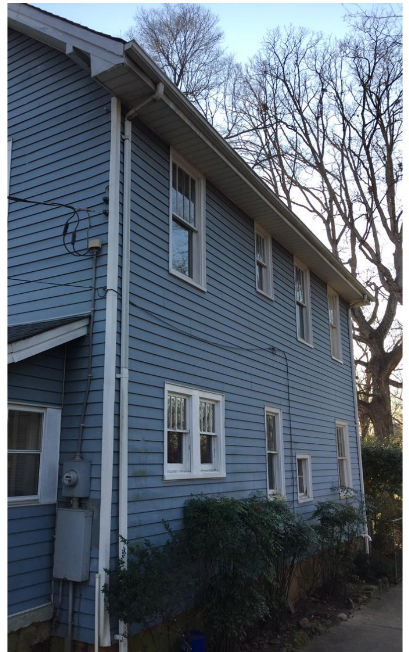
Left Elevation – Towards the Plaza