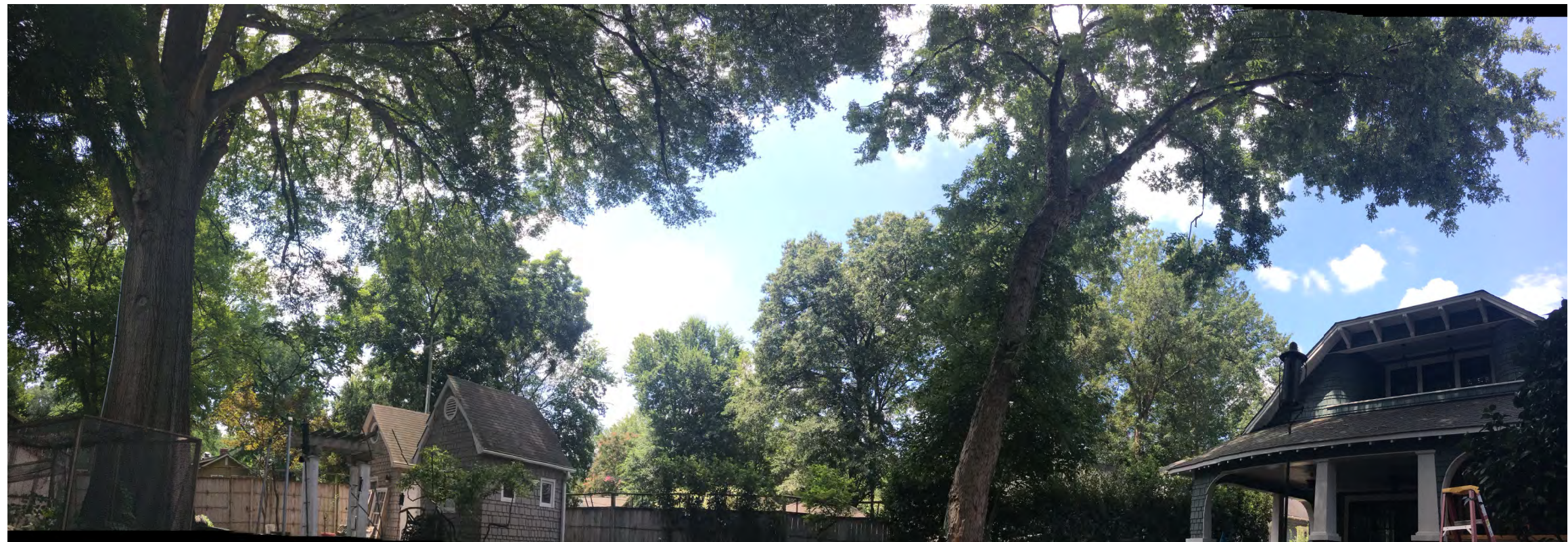
07 - PANORAMIC CANOPY FROM NORTH. THIS PHOTO SHOWS THE DOMINANCE OF THE OAK CANOPY AND THE LEAN OF THE MAPLE