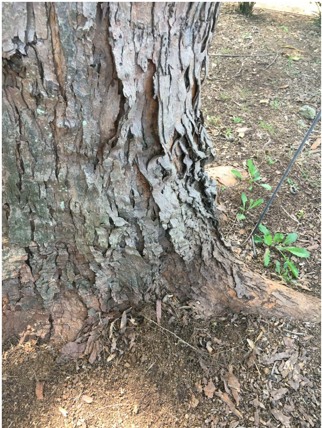
09 - BARK BUCKLING WEST SIDE AT BASE. THIS PHOTO SHOWS THE STRESS AT THE BASE OF THE TREE, WHERE THE BARK IS PULLING AWAY AND APPEARS TO SHOW SOME COMPRESSION BUCKLING ON THE WEST SIDE TOWARDS THE HOUSE