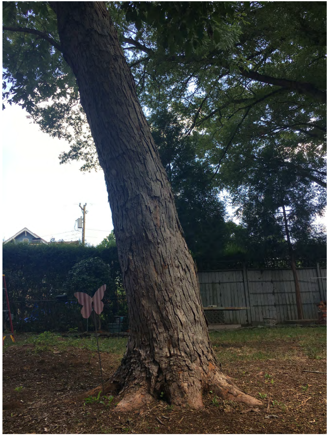
04 - TRUNK FROM SOUTH: STRAIGHT-ON PHOTO OF SINGLE TRUNK WITH SIGNIFICANT LEAN TOWARDS WEST / PORCH