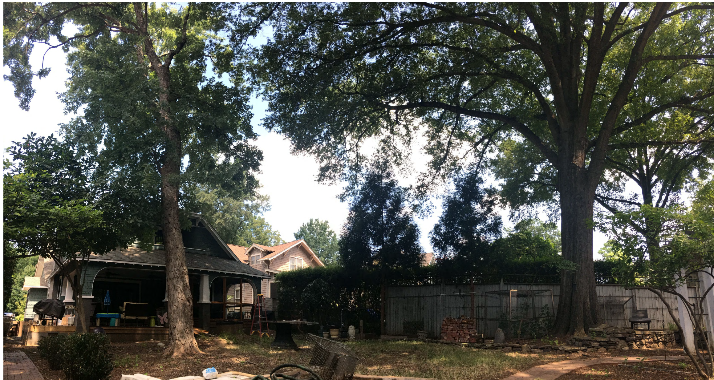
06 - PANORAMIC FROM SOUTH - THIS PHOTO SHOWS THE CANOPY, THE OAK (HEALTHY TO RIGHT) DOMINATES THE CANOPY ON THE BLOCK, THE MAPLE IN QUESTION HAS BEEN GROWING AWAY FROM THE OAK CANOPY TOWARDS THE HOUSE