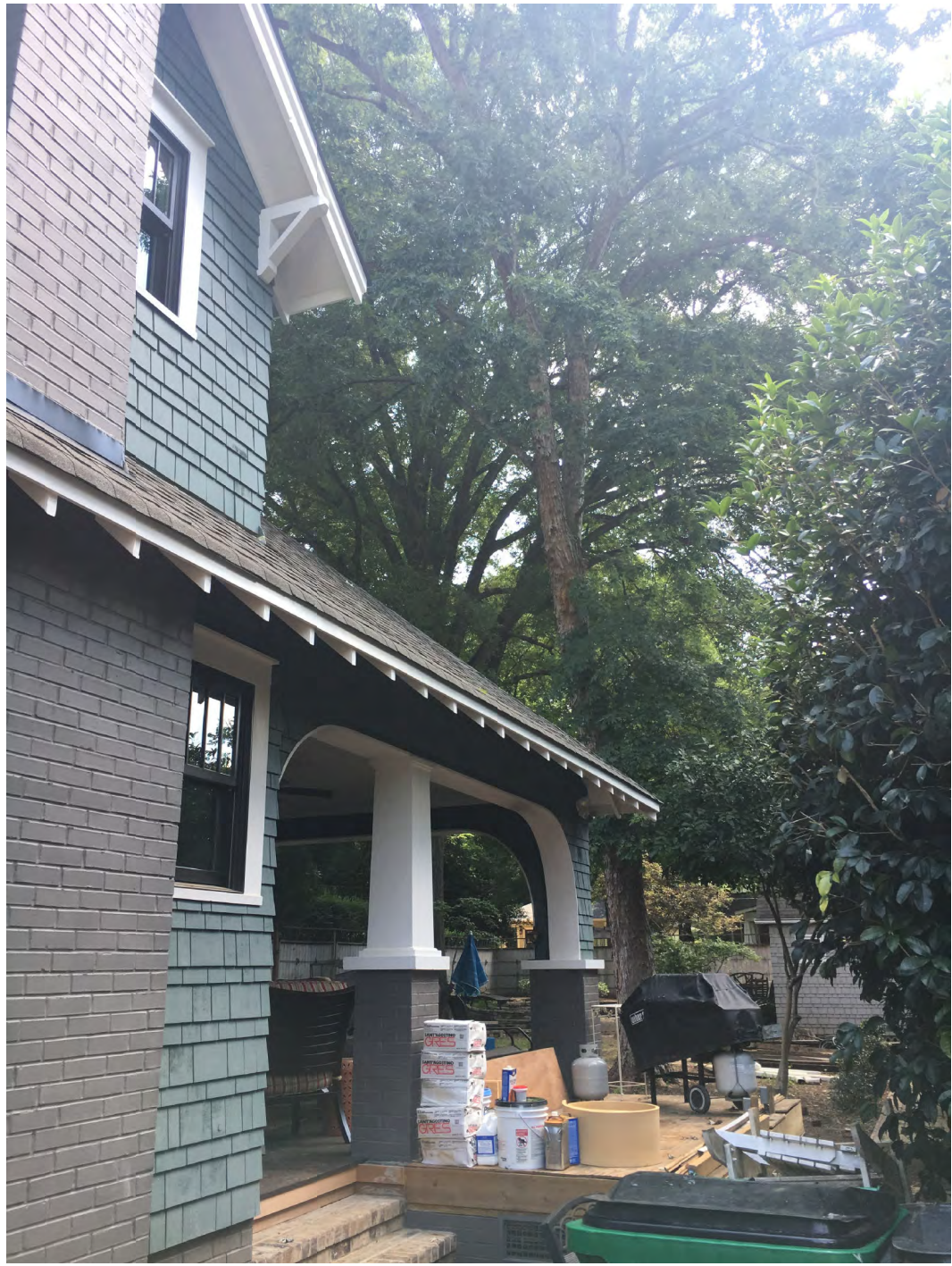
02 - DRIVEWAY: CLOSER TO TREE