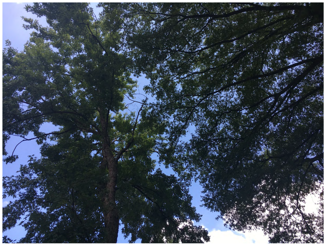
08 - CANOPY: THIS PHOTO SHOWS DEAD WOOD / LACK OF GROWTH ON THE EAST SIDE WHICH FACES THE OAK