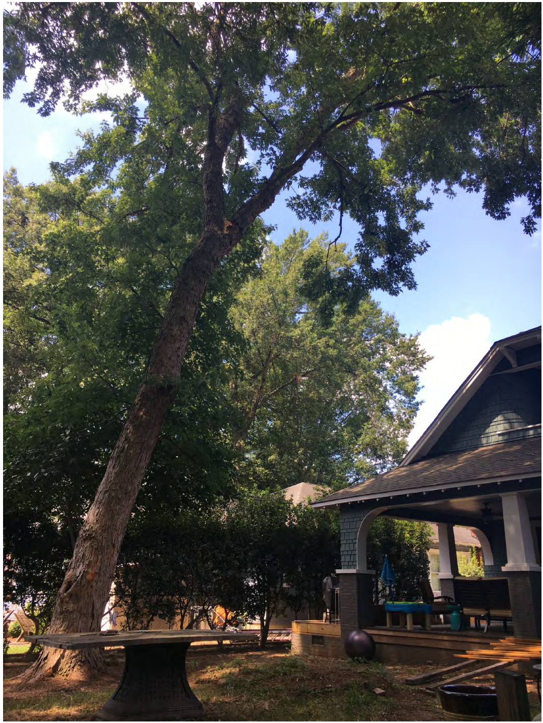
05 - VIEW FROM NORTHEAST