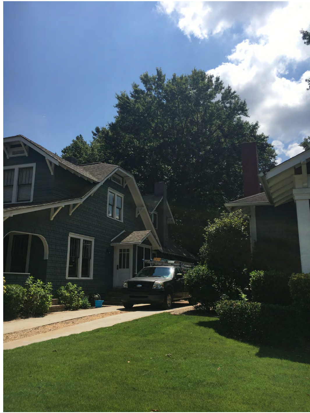
01 - STREET: VIEW FROM STREET TO TREE (IN BACKYARD)