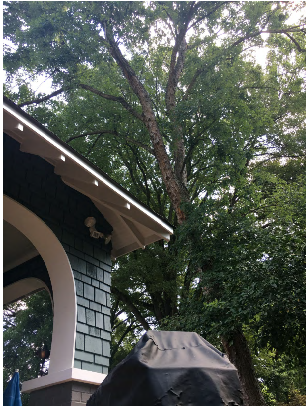
03 - REAR PORCH: SHOWS TREE LEANING SIGNIFICANTLY TOWARDS PORCH