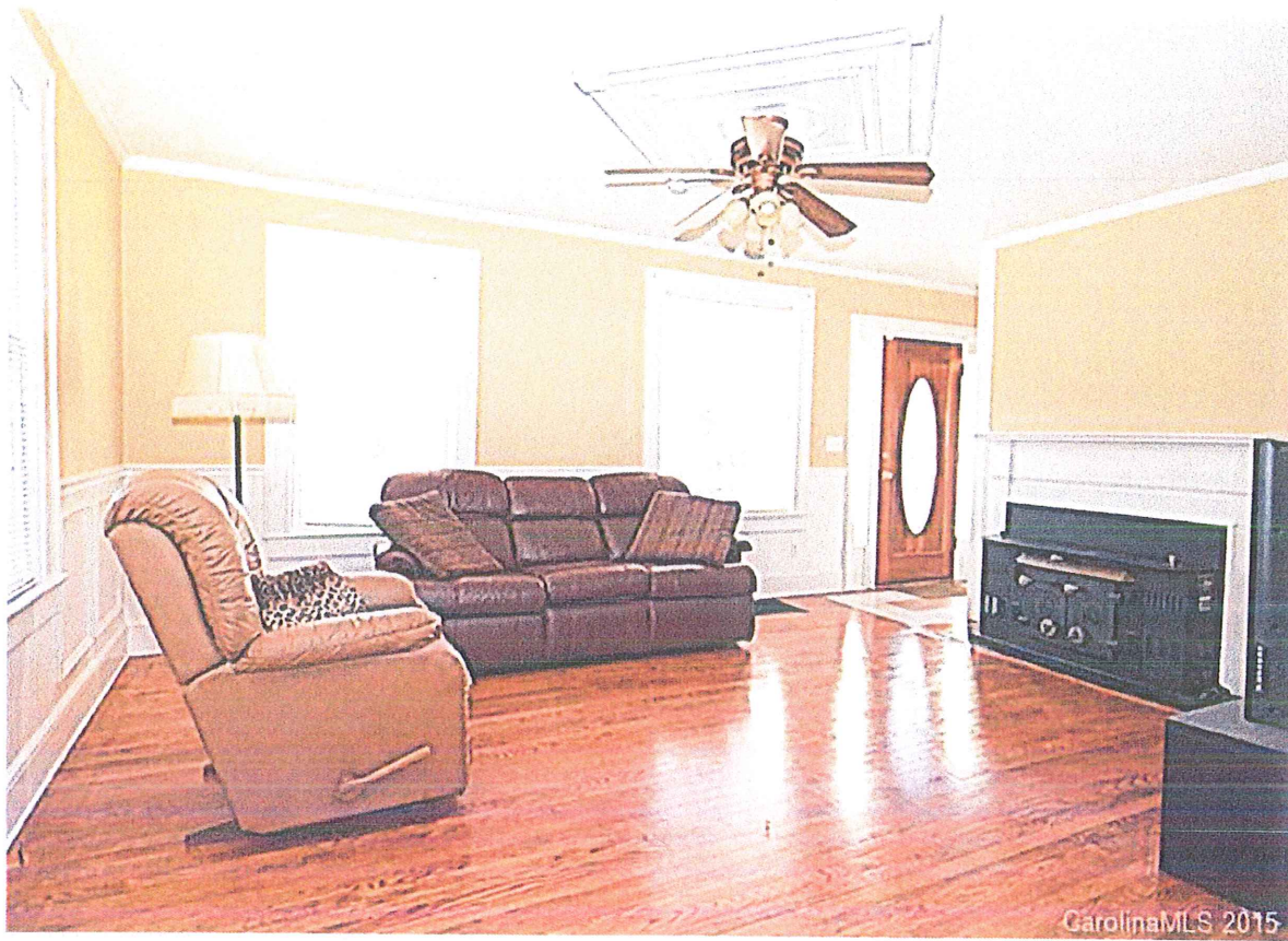
(Chimney picture 1 of 2)