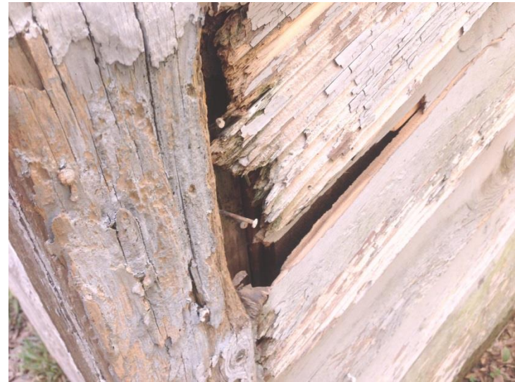
712 East Blvd Charlotte, NC 28203 5/12/14