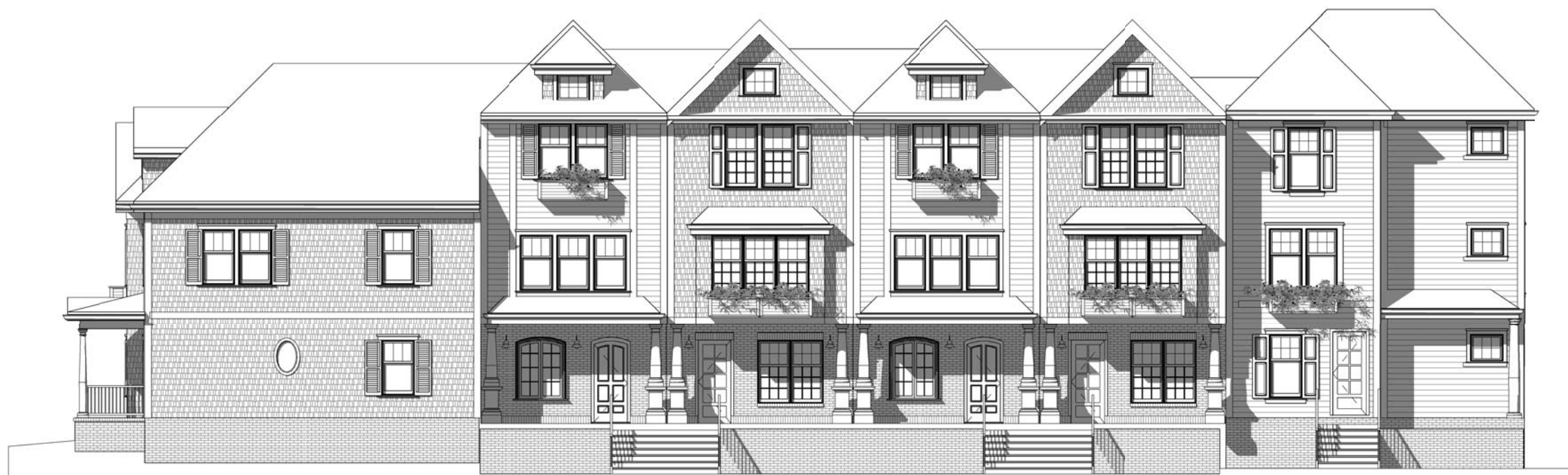
② E Promenade West Elevation 3/32" = 1'-0"