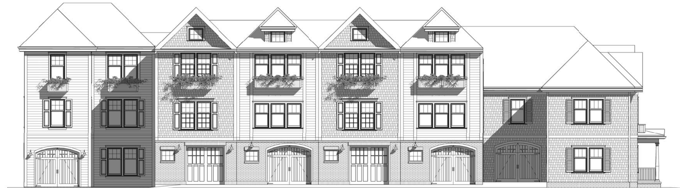
② E Lane East Elevation 3/32" = 1'-0"