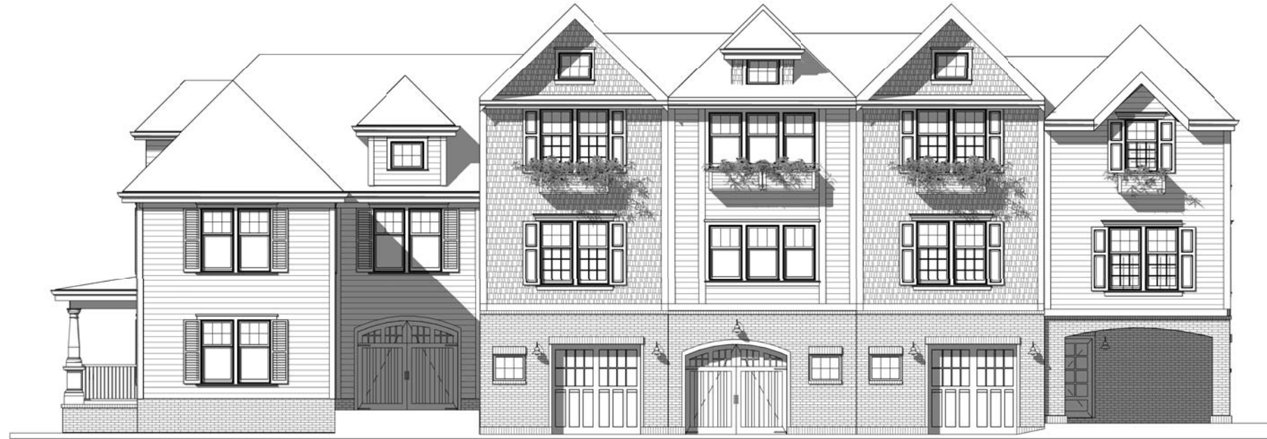
① E Lane West Elevation 3/32" = 1'-0"