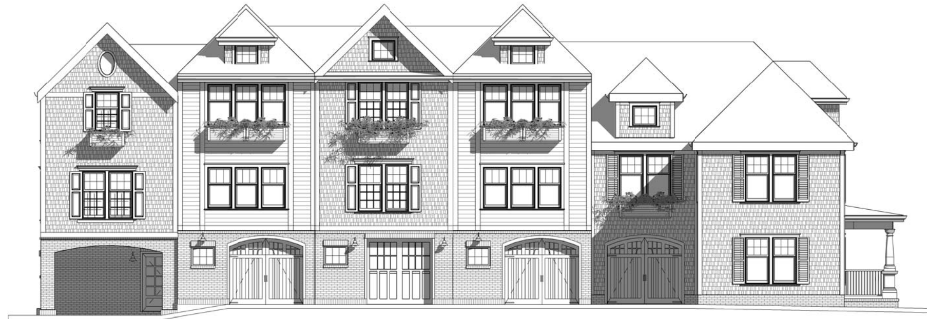
② W Lane East Elevation 3/32" = 1'-0"