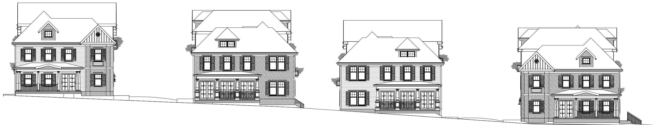
① Euclid Avenue Elevation 1/16" = 1'-0"