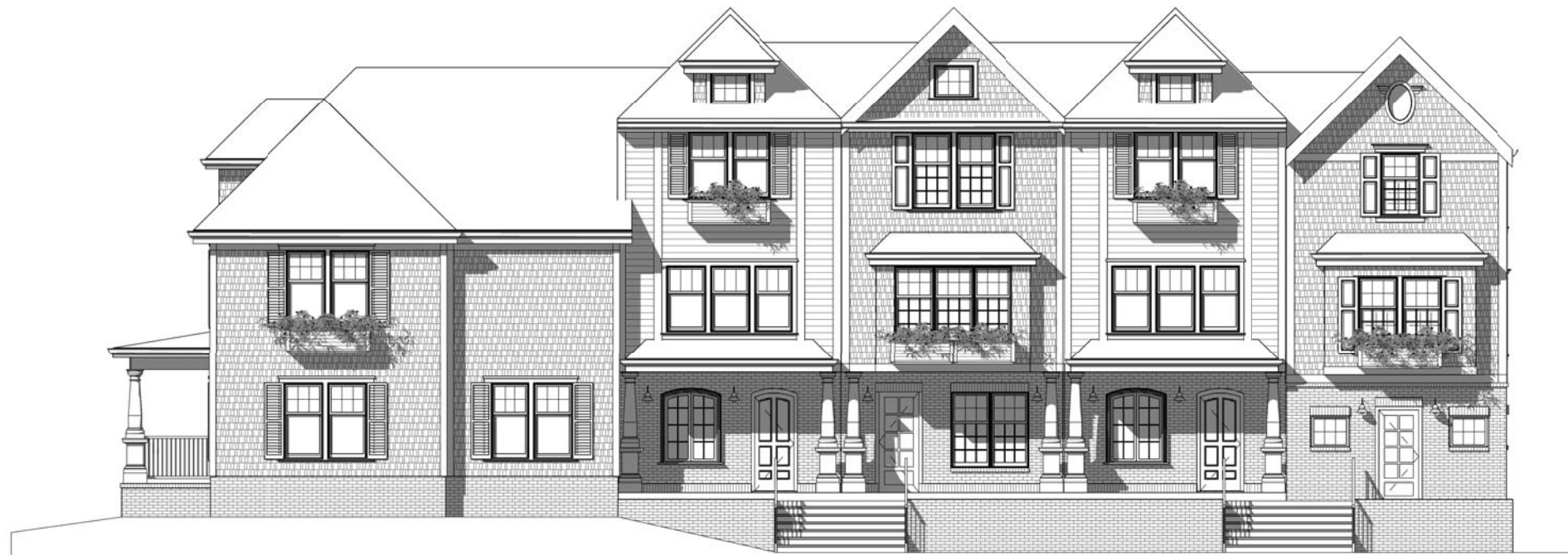
① Central Promenade West Elevation 3/32" = 1'-0"