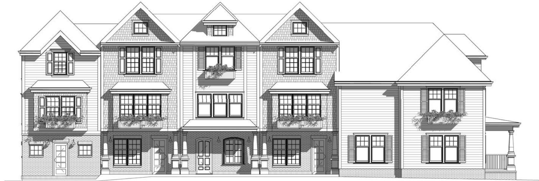
② Central Promenade East Elevation 3/32" = 1'-0"