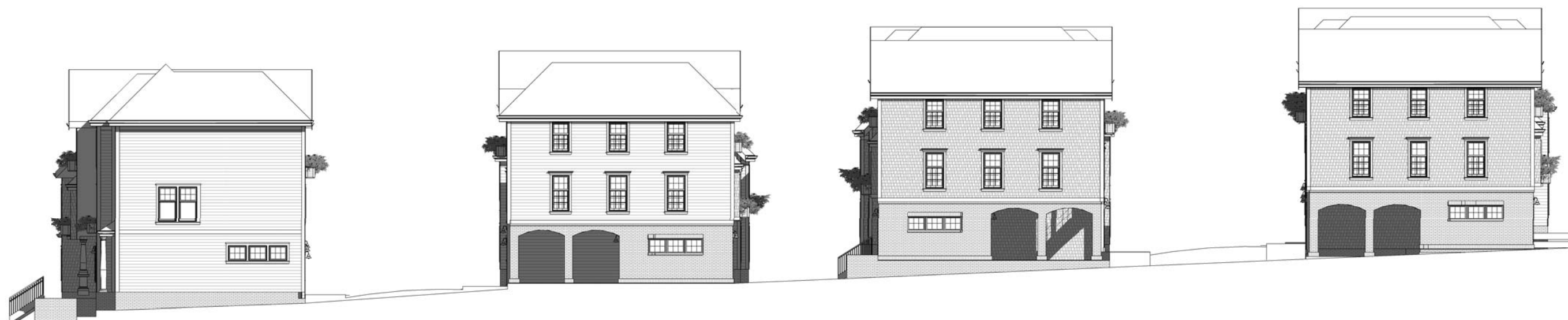
② North Lane Elevation 1/16" = 1'-0"