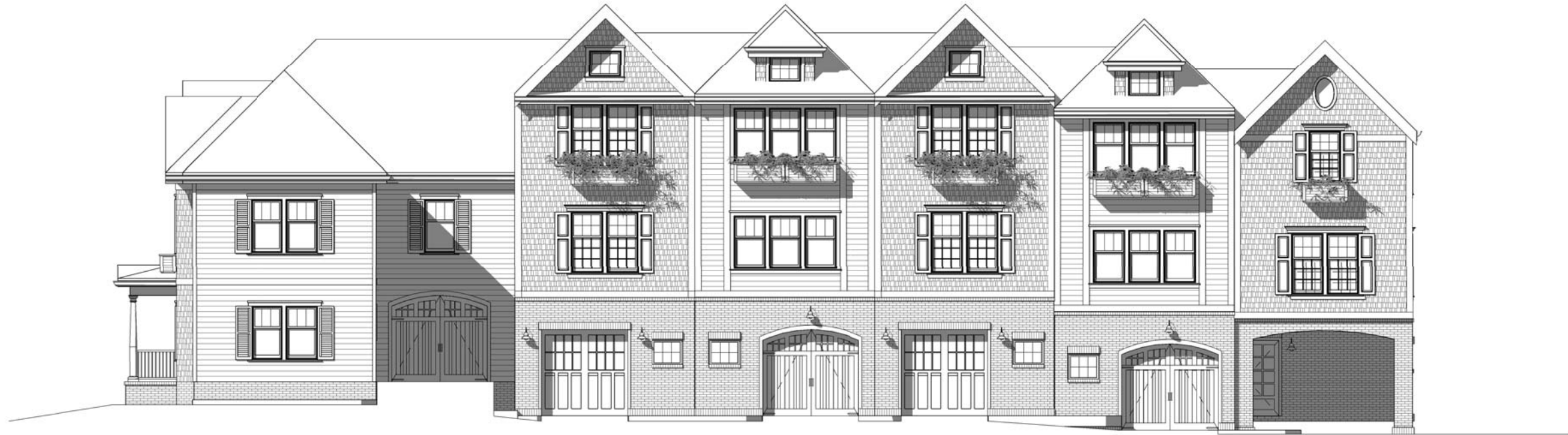
① W Lane West Elevation 3/32" = 1'-0"