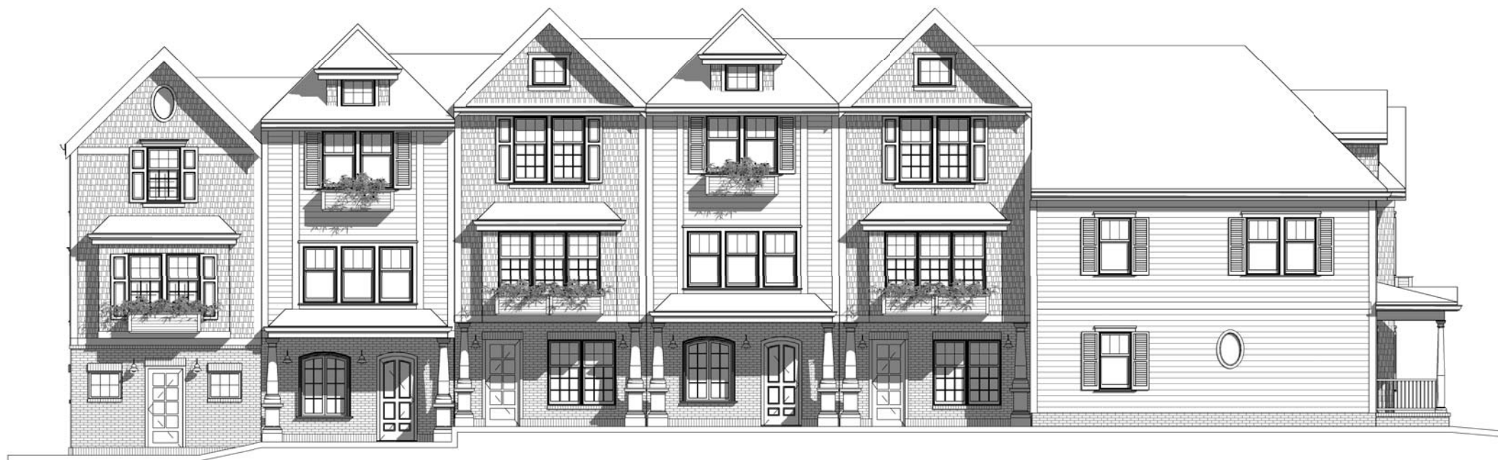
① W Promenade East Elevation 3/32" = 1'-0"