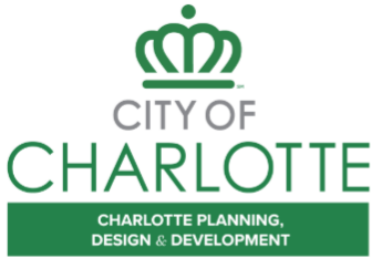
Exhibit B (continued)