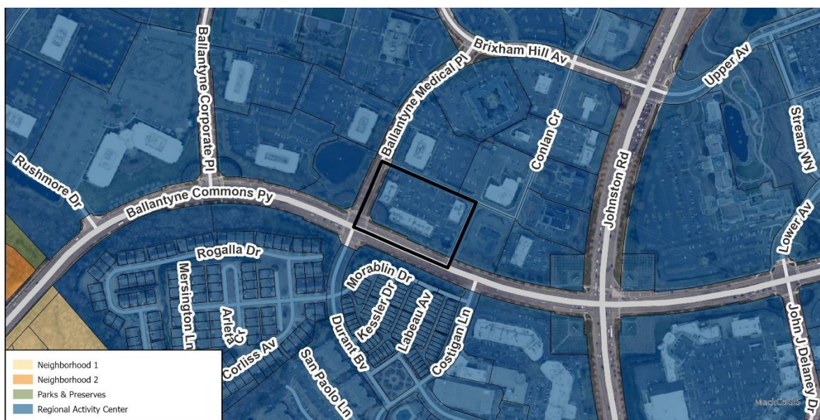
Table 5 below represents an analysis of how the petition meets the components of the Regional Activity Center (RAC) Place Type.