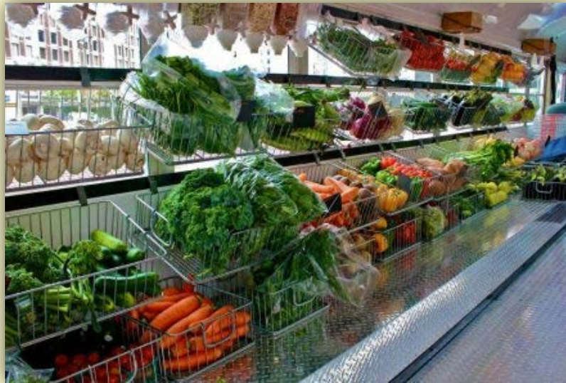
Charleston – “Fresh Truck”