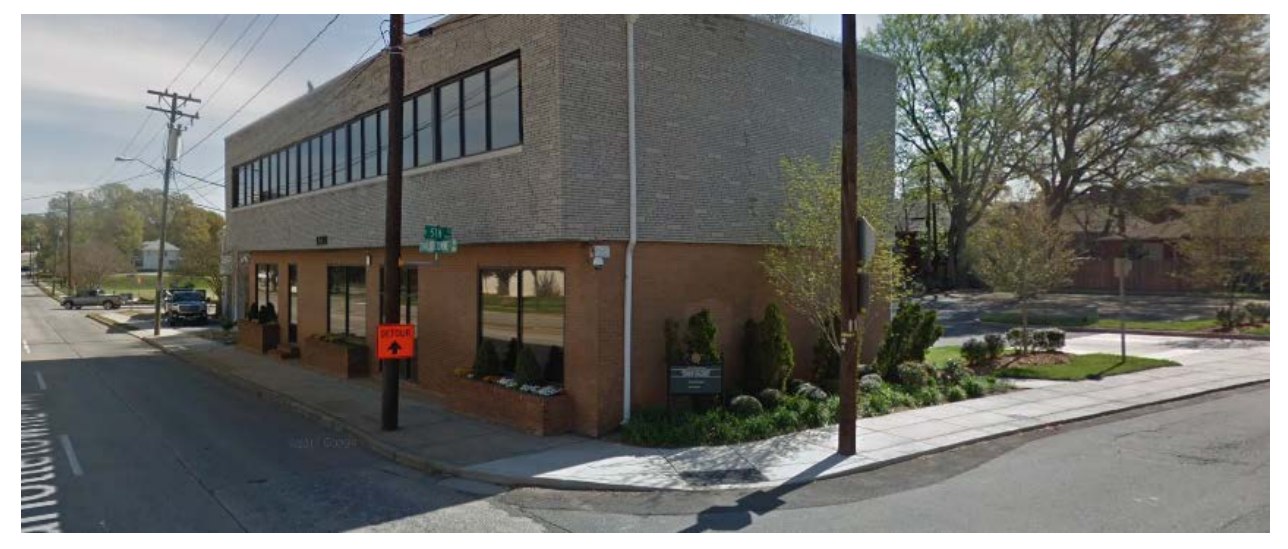
The surrounding properties are developed with institutional campus buildings (CPCC), and with various retail and office buildings.