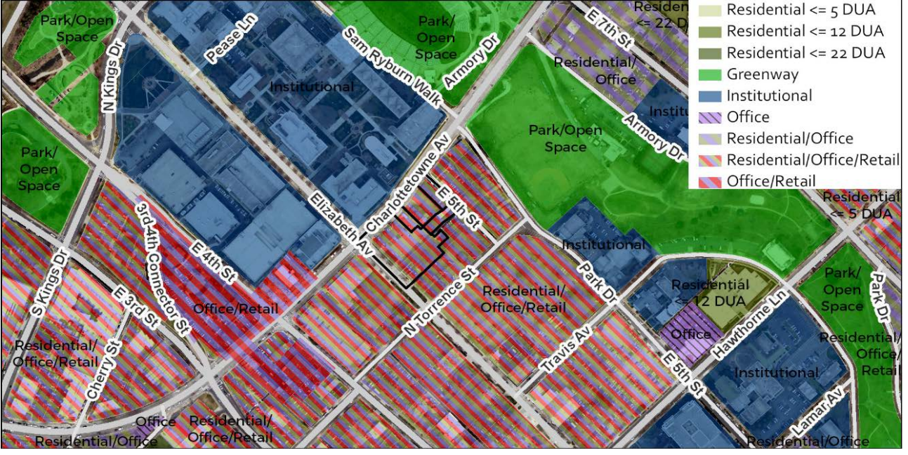
The Elizabeth Area Plan (2011) recommends a mix of office, residential, and retail uses.