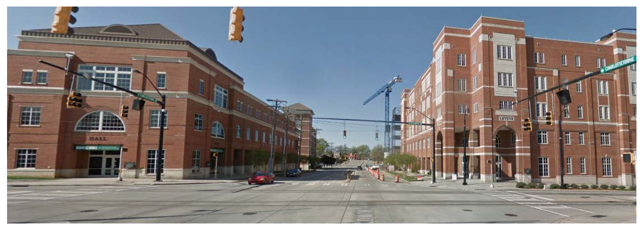
Across Charlottetown Avenue is the CPCC midtown campus.

The existing site is developed with retail and office buildings or vacant