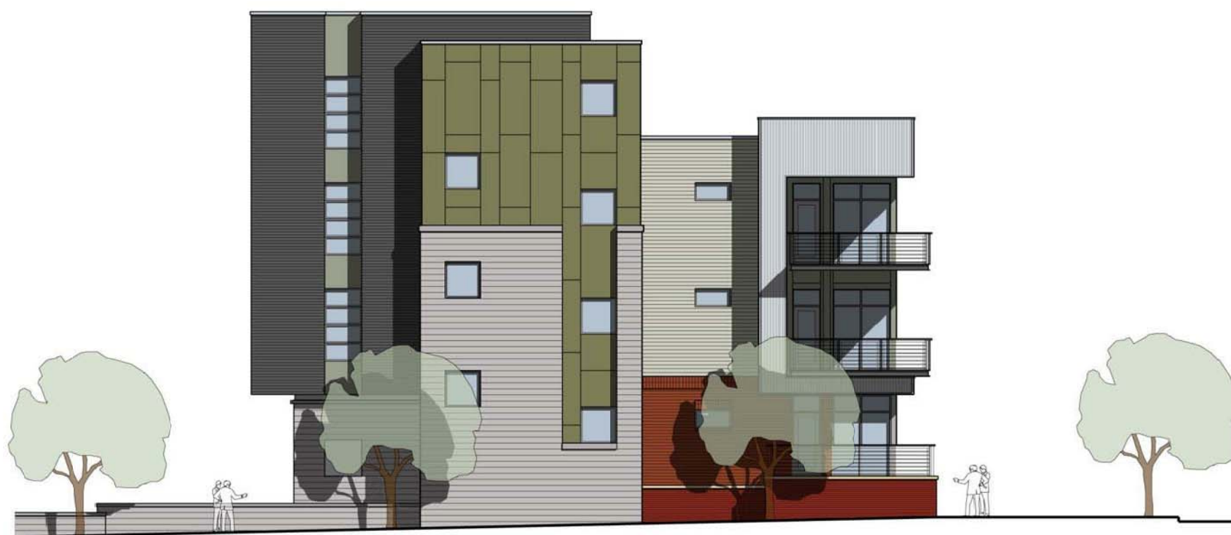
North Davidson Street Elevation