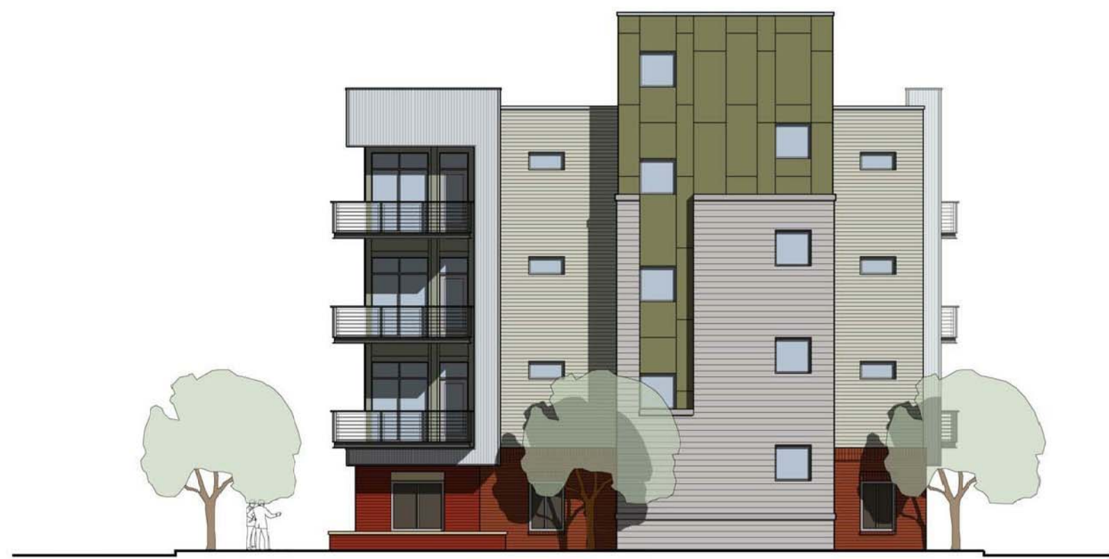
North Caldwell Street Elevation