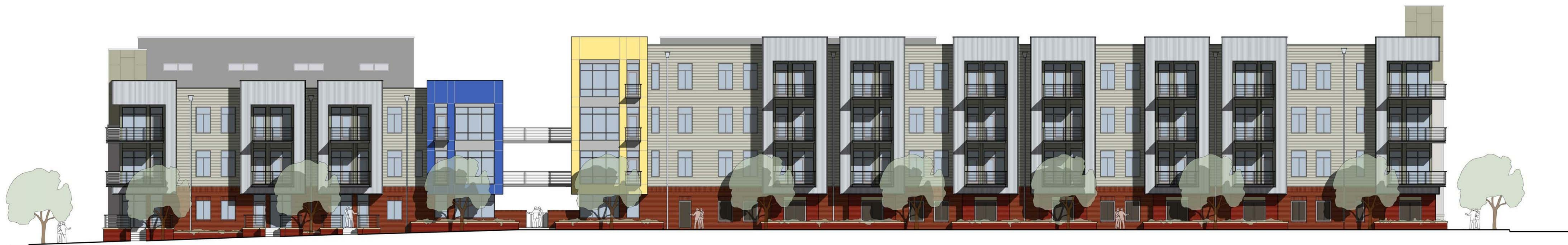
East 16th Street Elevation