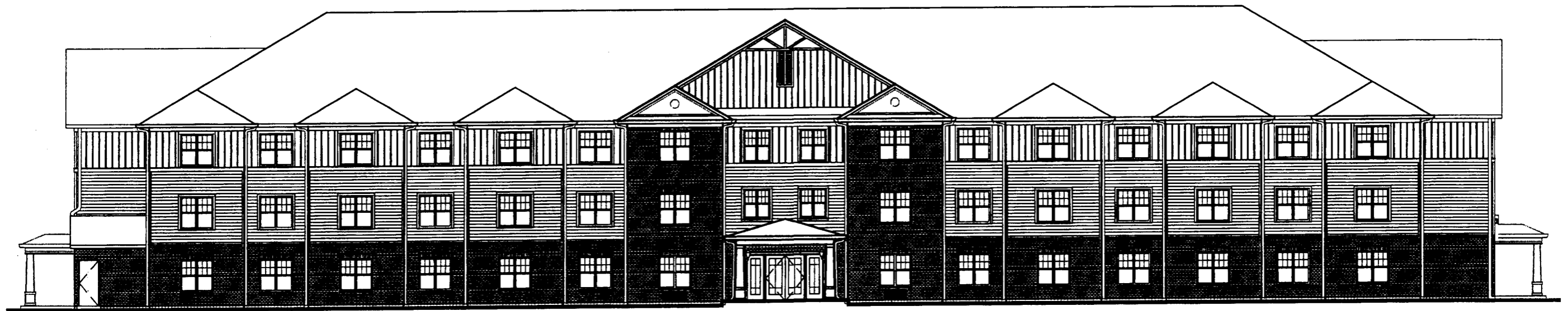
01 Front Elevation