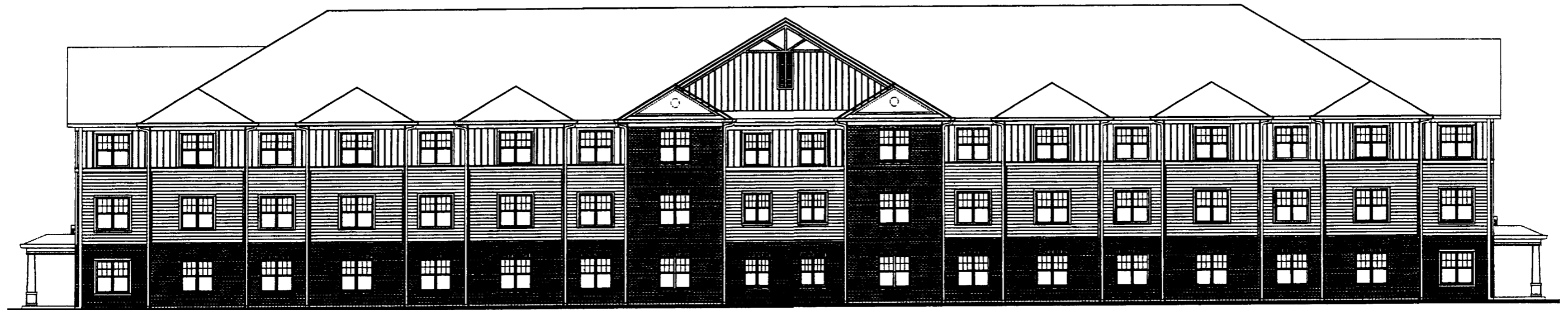
02 Rear Elevation