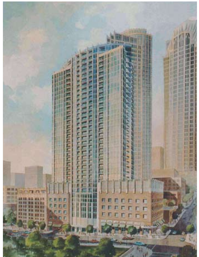
▲ The Avenue, a 386 unit residential tower currently under construction.