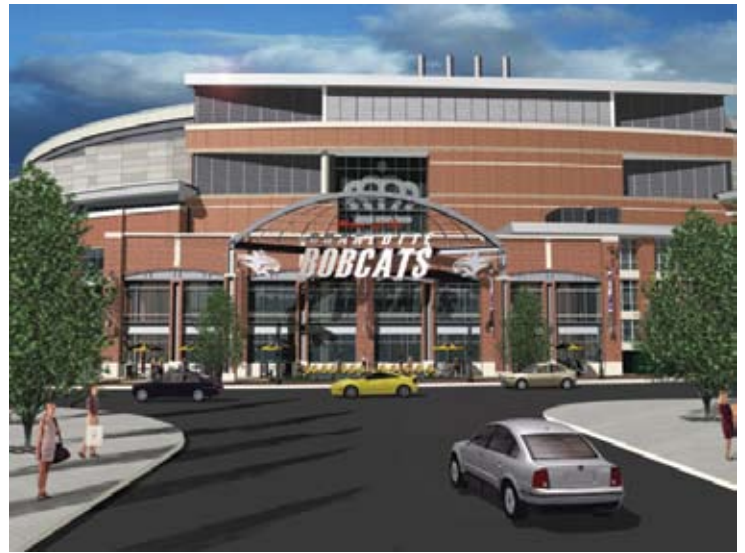
▲ New Charlotte Bobcats Basketball Arena located at the Trade Street light rail station.