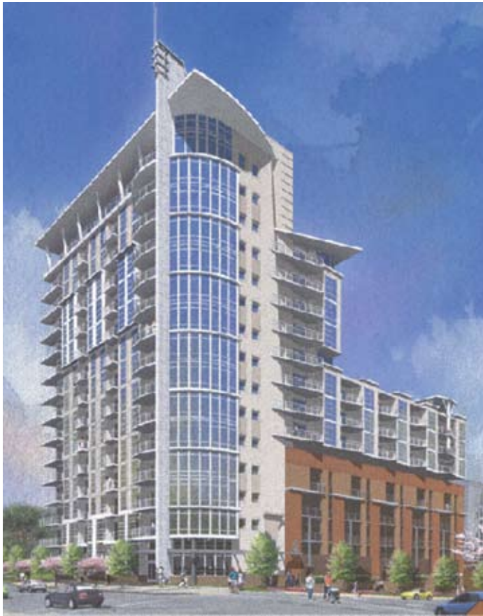
▲ Courthouse, a 16 story residential tower located near the 7th Street Station

With the South Corridor under construction, the City is committed to realizing the smart growth opportunities the transit investment affords. To assist with transit oriented development along the corridor, the City has created a Transit Oriented Development Response Team. The TOD Response team involves key City departments that oversee important aspects of redevelopment projects. The goal of the team is assist developers as they work through City regulations and requirements. This included rezonings, plan review, right-of-way encroachments, infrastructure improvements, transit construction schedules and financial assistance. The team is dedicated to promoting and expediting development along transit corridors.