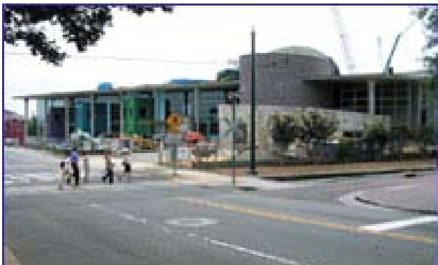
▲ ImaginOn, the new children's center, located at the 7th Street station.

An existing extensive street network includes major and minor thoroughfares and a relatively fine-grained network of local streets with short block spacing. Eventually, some streets will introduce a streetcar system that will link services from Presbyterian Hospital to the east of Uptown with Johnson C. Smith University to the west. The map of Uptown is found to the left.