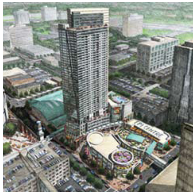
▲ Epicenter, the proposed mixed-use development, at the Trade Street Station.