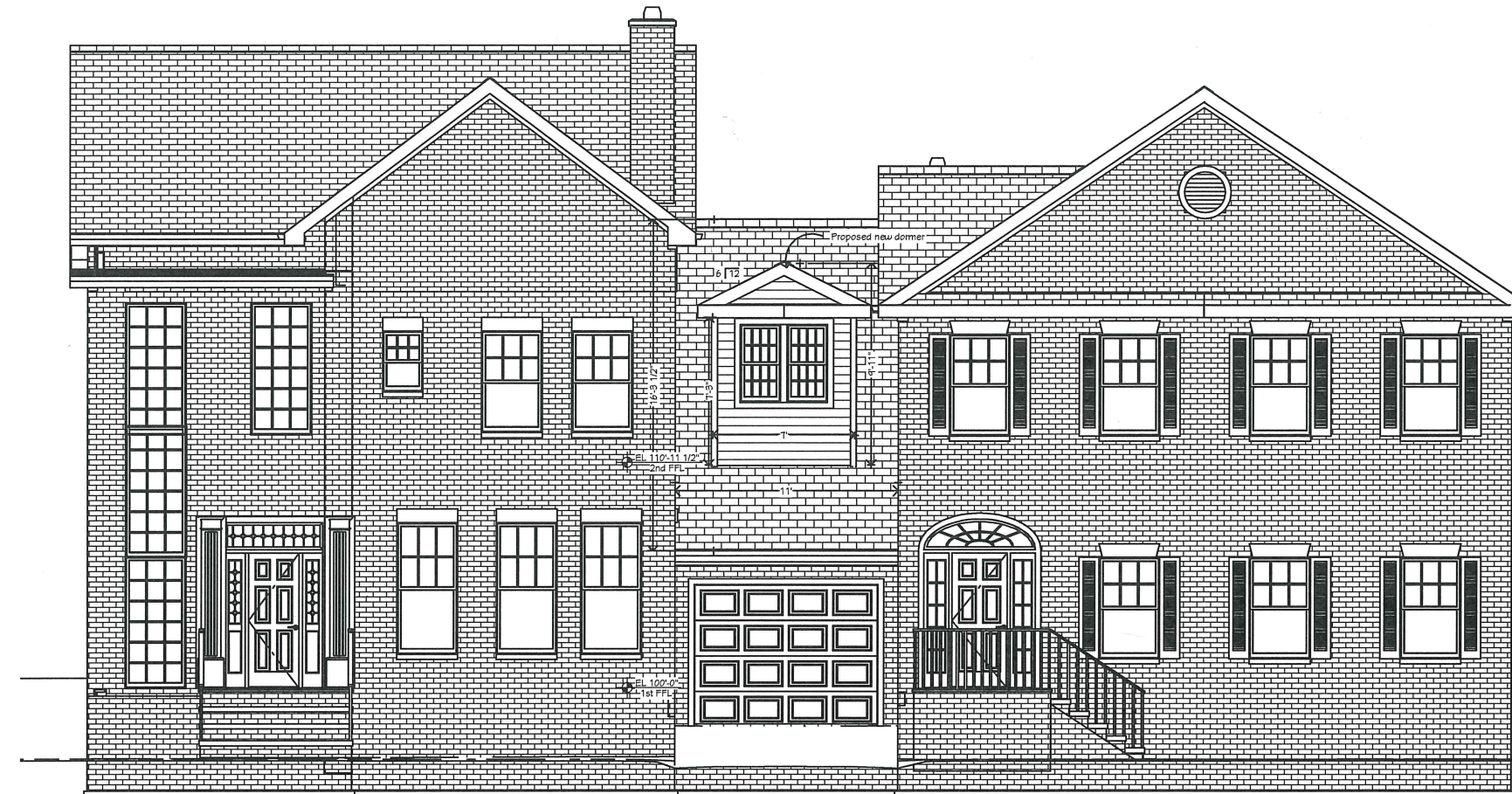
Front Elevation 1/8" = 1'-0"