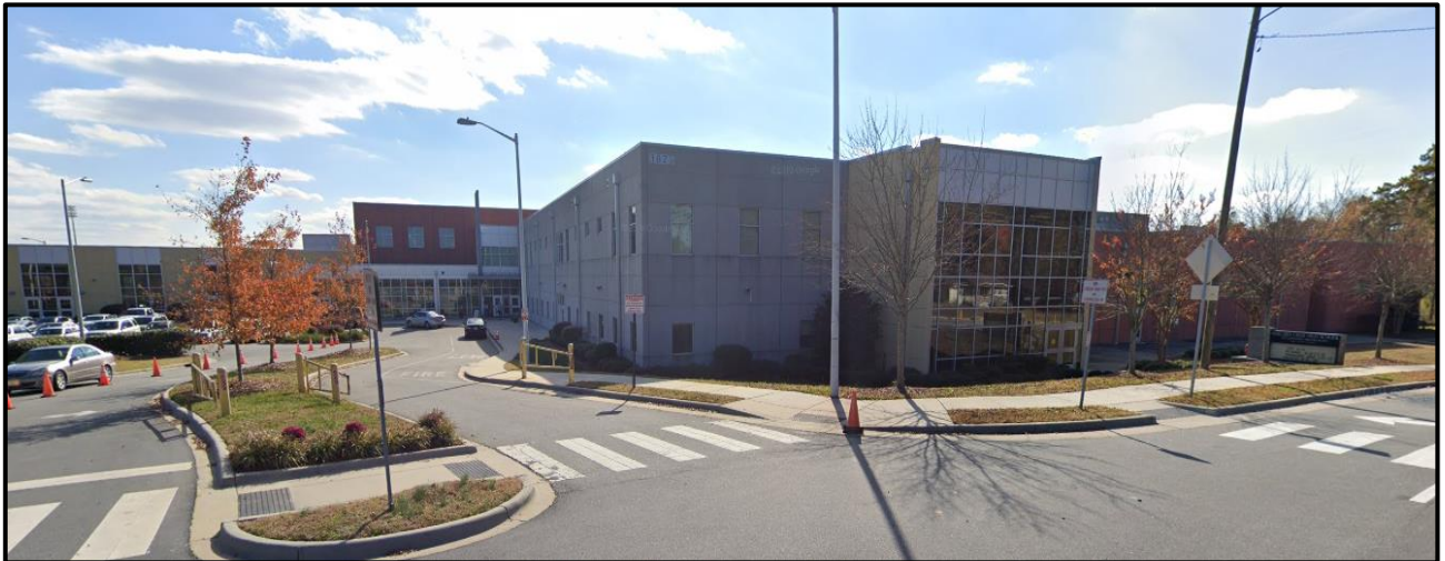
The property to the south along Johnston Oehler Road is Mallard Creek High School.