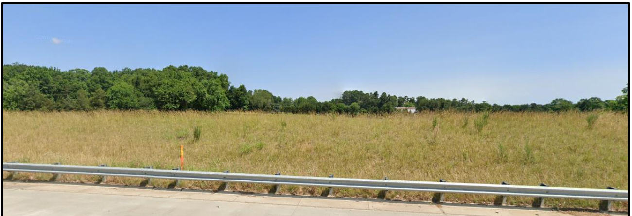
The property to the north bordered by Interstate 485 is currently vacant but rezoning 2019-078 will allow 440 multi-family units.