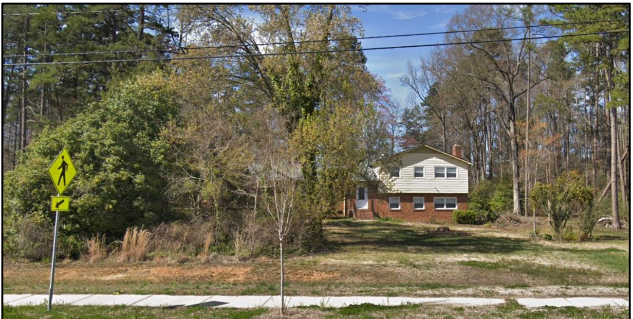
The property to the west along Johnston Oehler Road is developed with a single-family home.