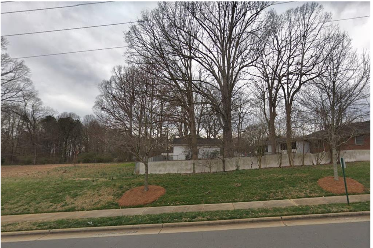
The property to the south is developed with a single family house.