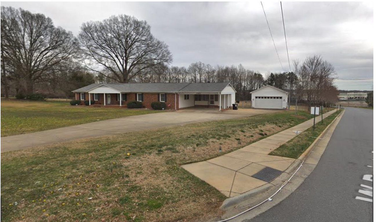
The property to the west is developed with a single family house.