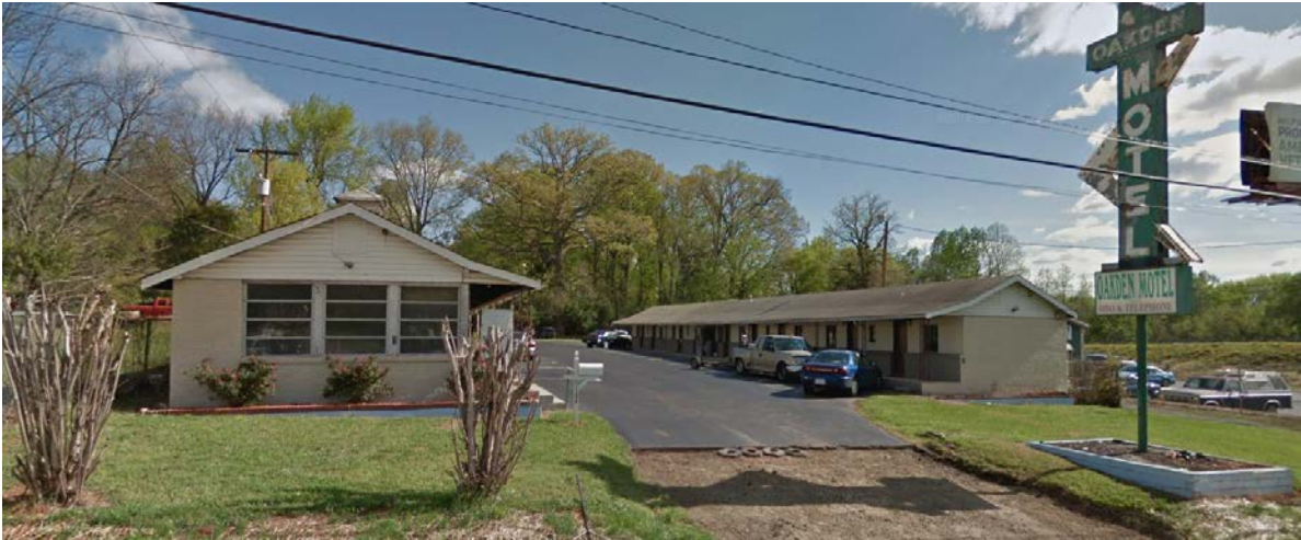
The property to the east is developed with a small motel.