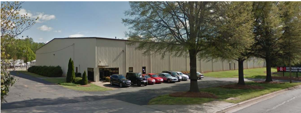
Properties to the west include industrial, distributive, and office uses and vacant land.