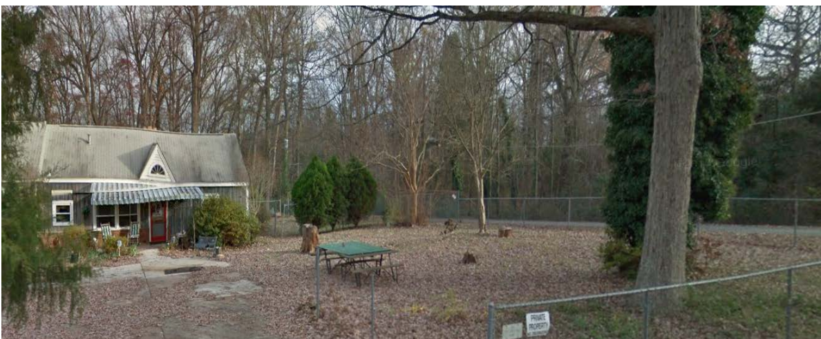
Properties to the north include vacant land rezoned in 2016 to I-2 (general industrial), additional vacant residential lots acquired by the City of Charlotte, and two remaining single family homes.