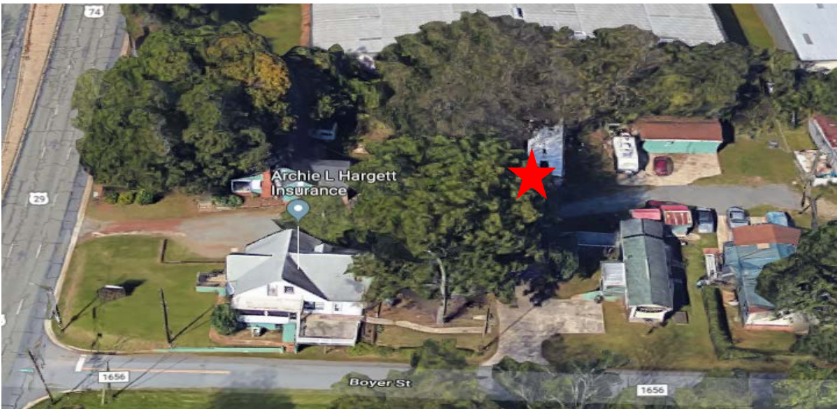
Properties to the south include office and residential uses. (The subject property is represented by the red star.)