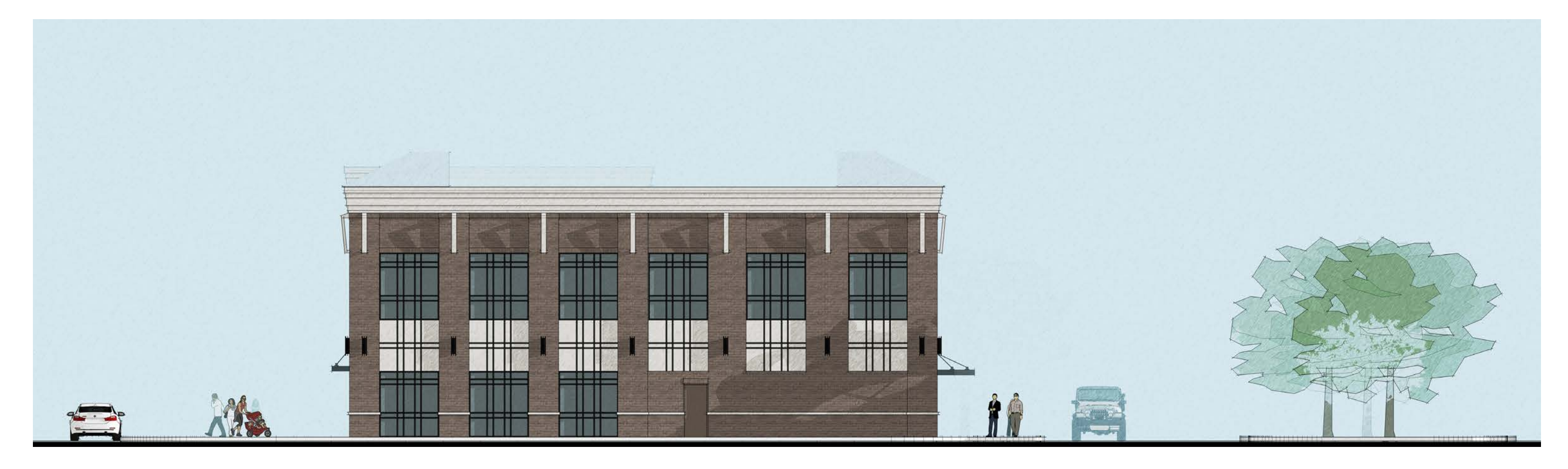
ENTRY DRIVE ELEVATION