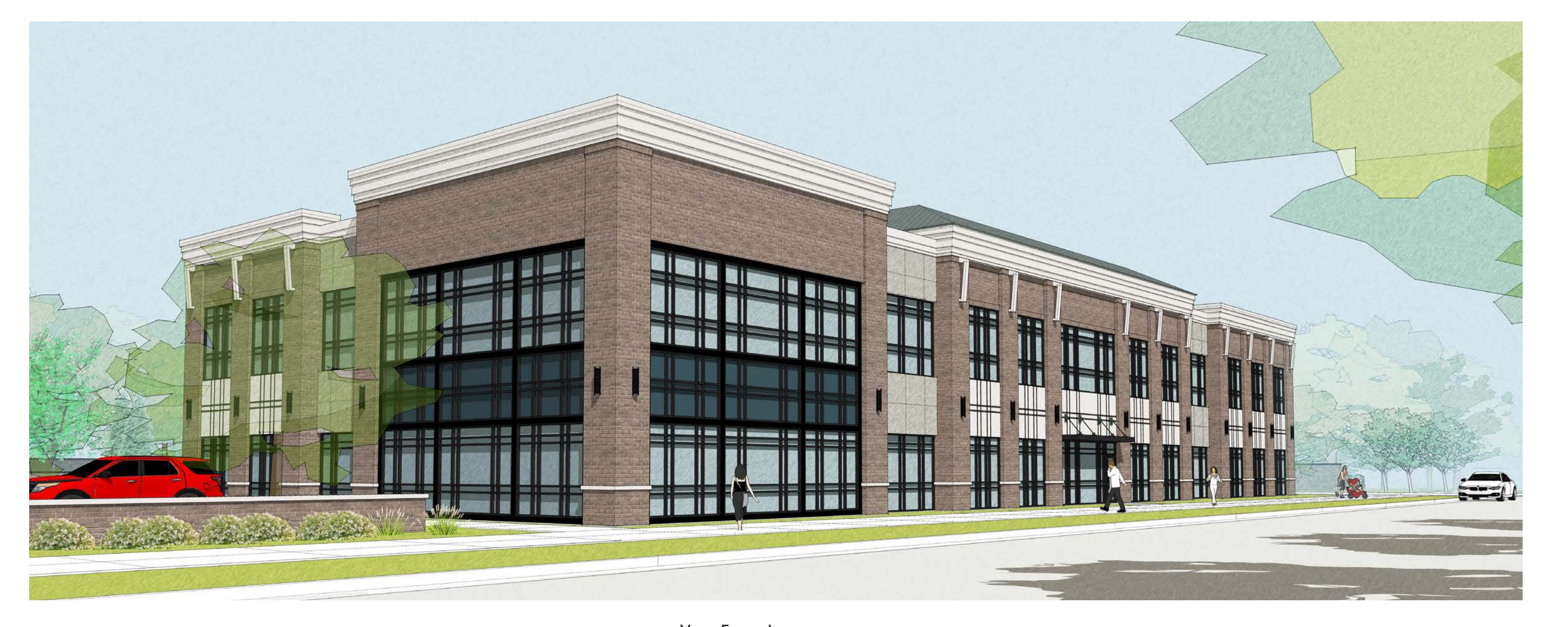
VIEW FROM INTERSECTION