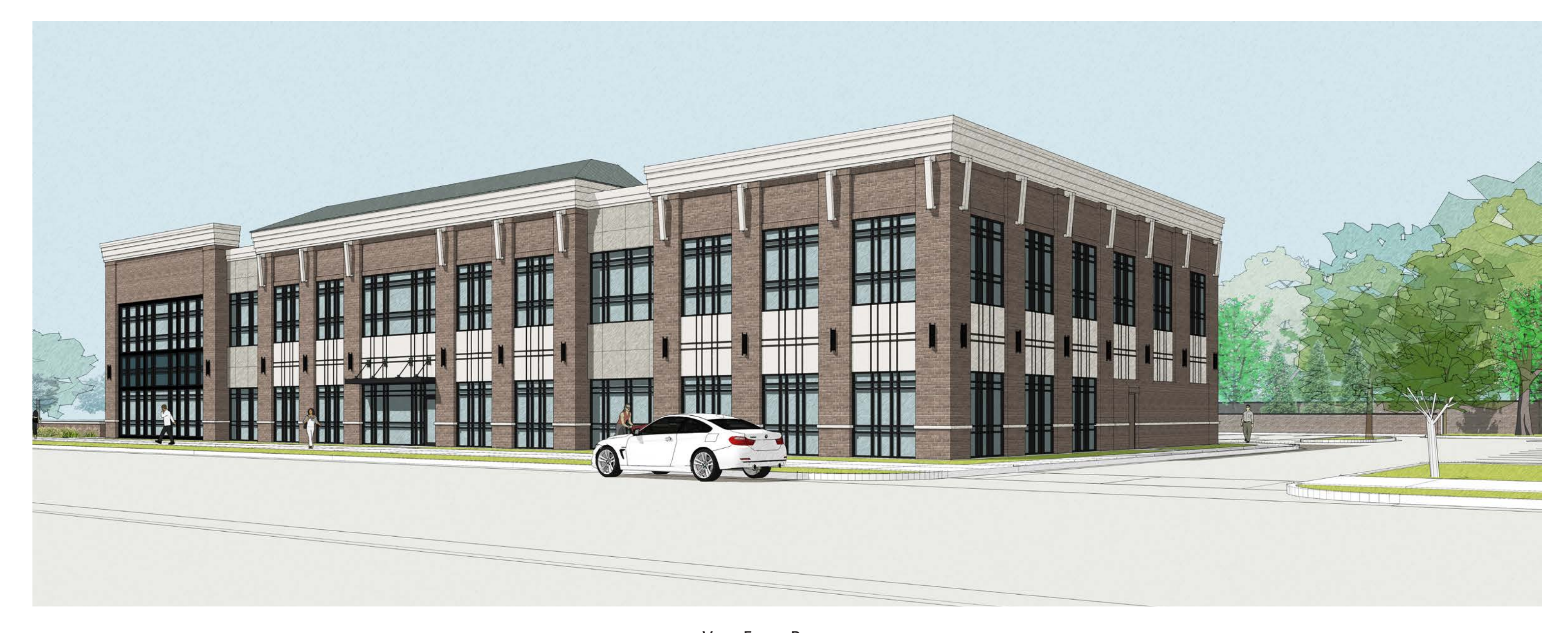
VIEW FROM RANDOLPH