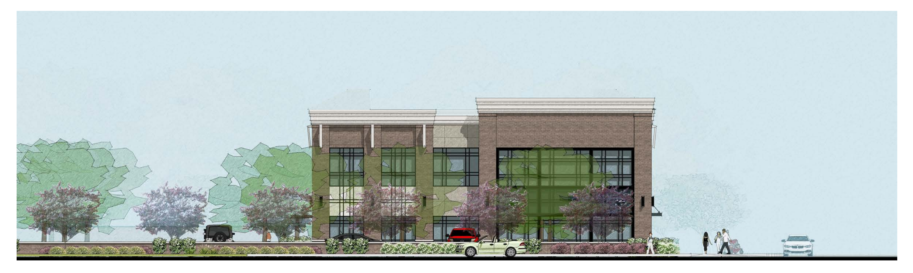
HODGSON ROAD ELEVATION