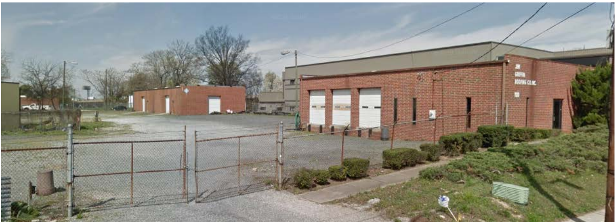
The subject property is developed with a warehouse/office use.