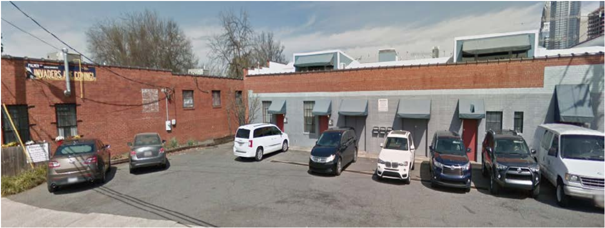
Properties to the south include a mix of warehouse/office, distribution, and retail.