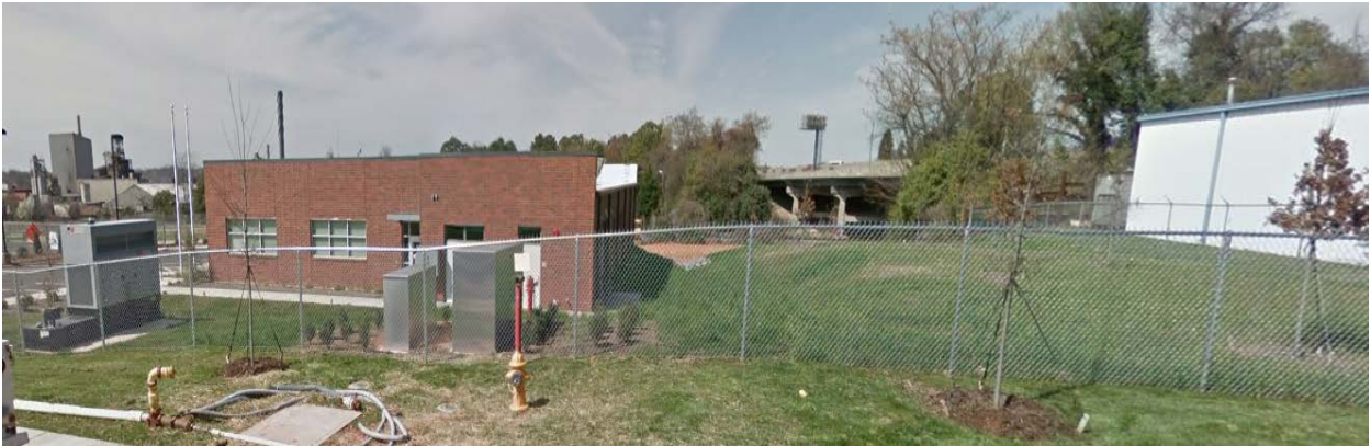
Property to the east are developed with warehouse/office, and manufacturing uses.