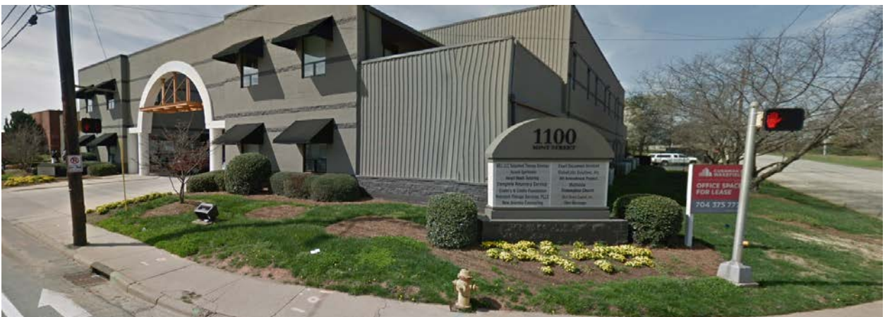
Properties to the north are developed with office and retail uses.