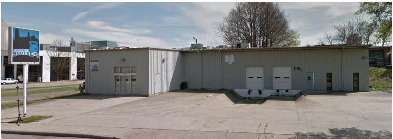
The property to the east has been readapted into a sports gym.