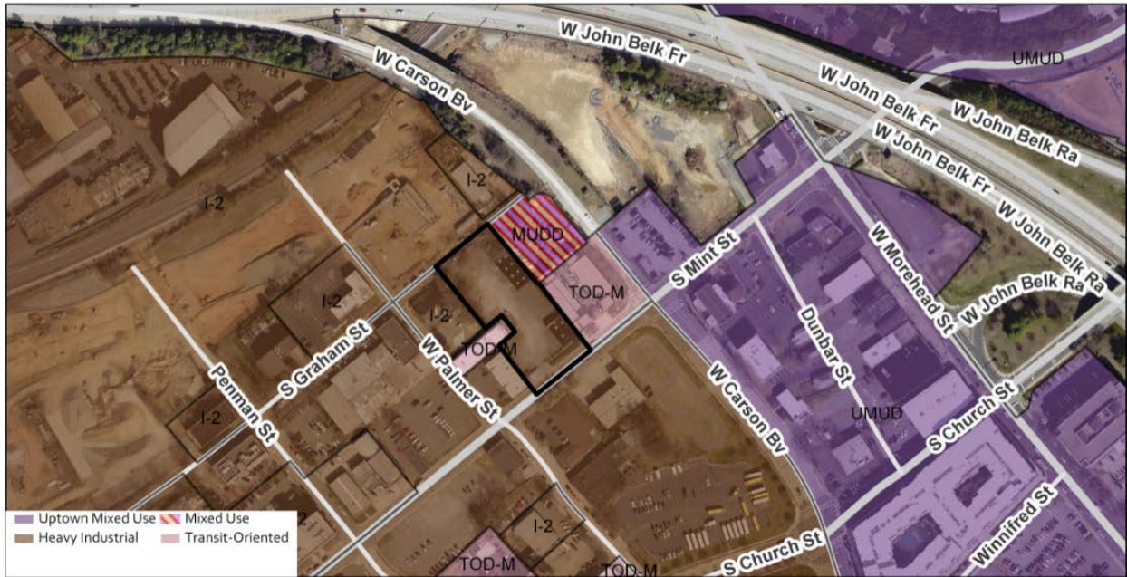
The subject property is zoned I-2 (general industrial) and is developed with a warehouse/office use.