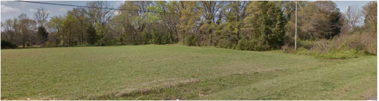
The subject property is vacant.