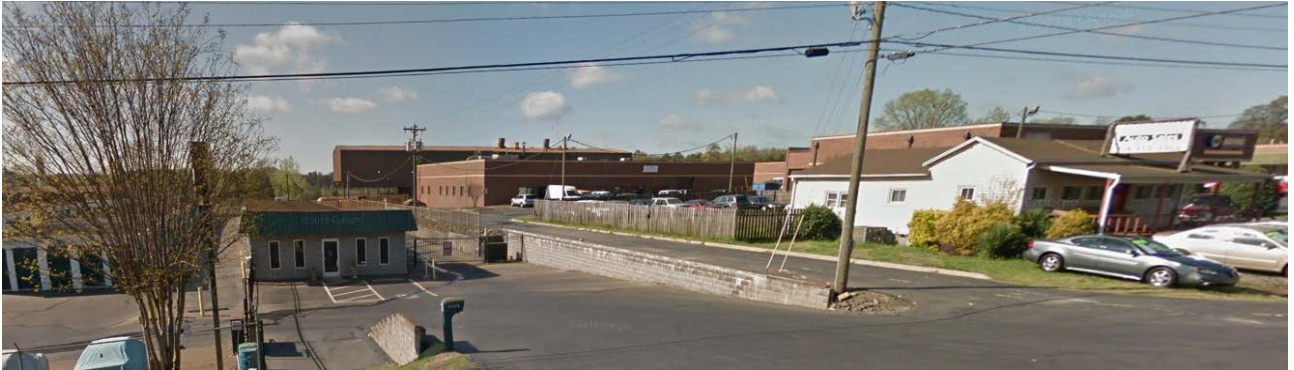
A vacant property is adjoining the subject site to the east. Further east, in Cabarrus County, the properties are a mix of commercial, retail, and industrial uses.