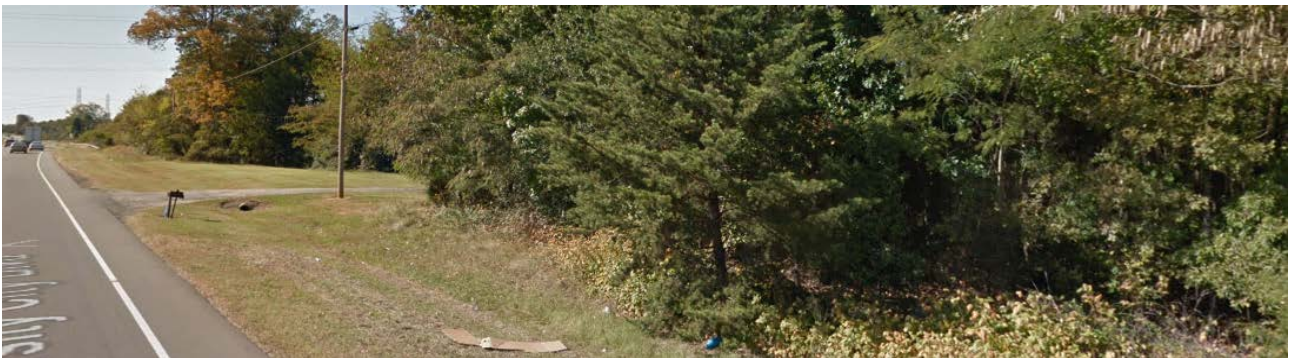
Properties to the north are mostly vacant with some single family homes and a cemetery.