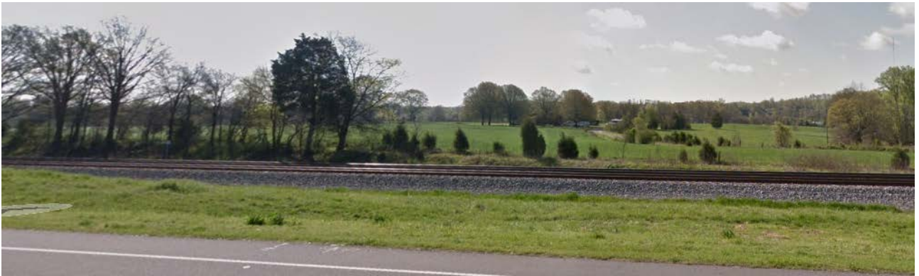
The subject property is bordered to the south by the railroad.