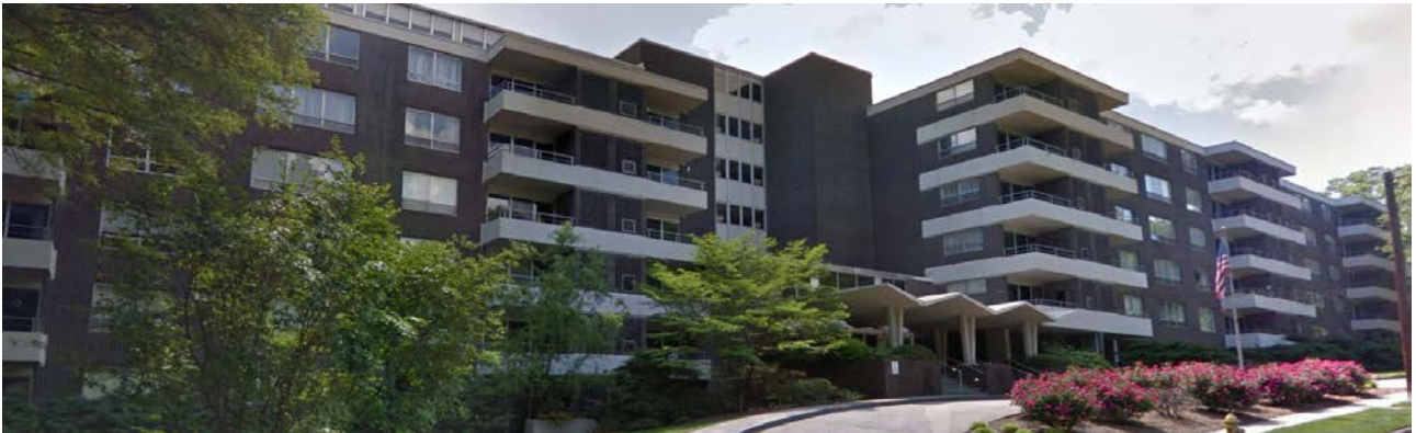
The property to the south is developed with a multi-family building.