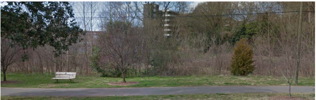
Little Sugar Creek is adjacent to the property to the east.