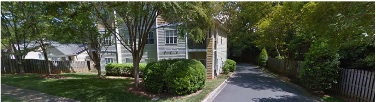
Properties to the north are developed with multi-family residential then single family residential.