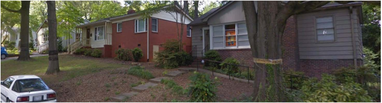
The subject property is developed with four single family homes.