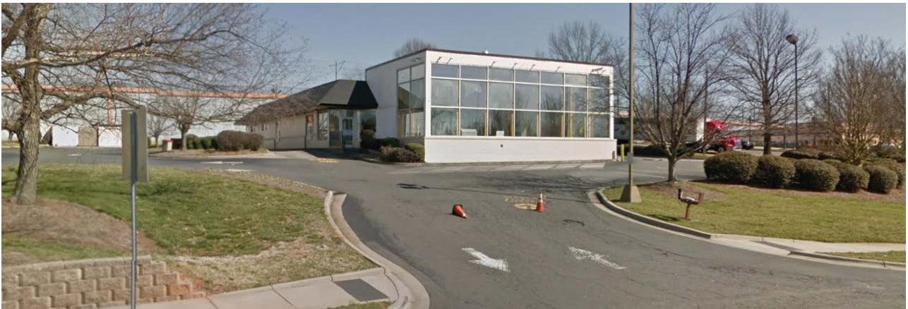
The subject property is zoned B-1SCD (shopping center district) and developed with a vacant McDonald's restaurant.