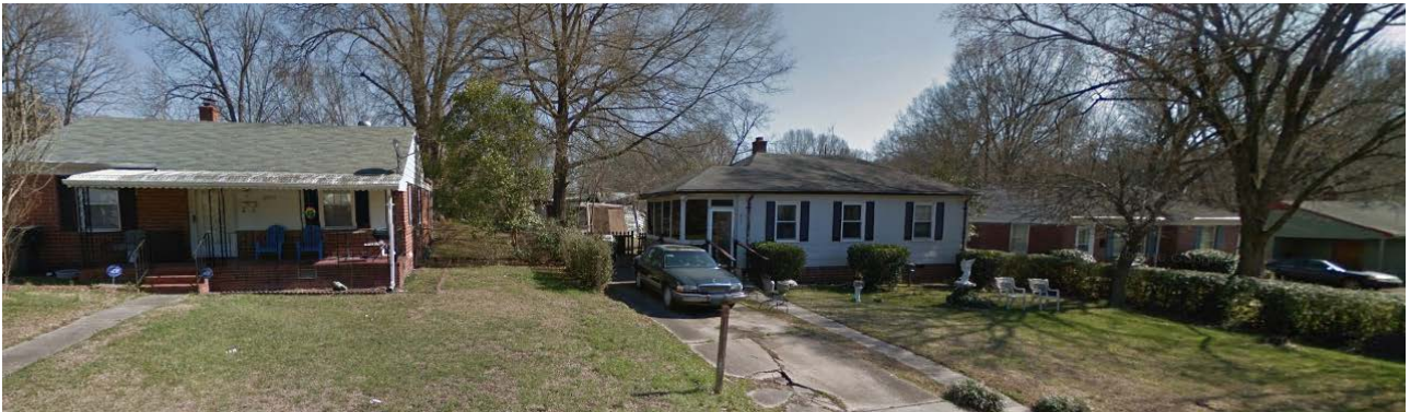
Surrounding properties are developed with single family homes.