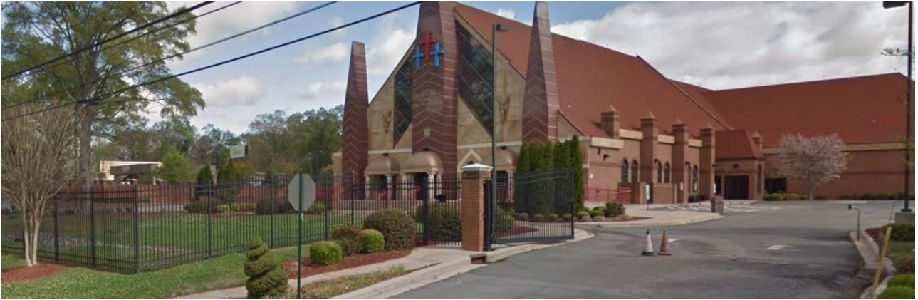
The property to the north is developed with a religious institution zoned I-1 (light industrial).