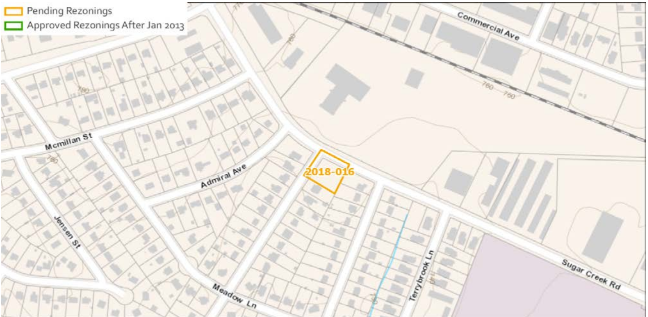
There have been no recent rezonings in the immediate area.